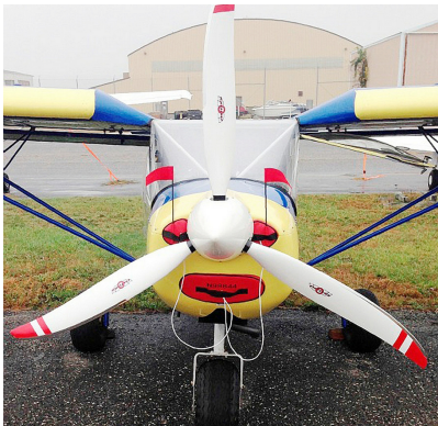
ENGINE PLUGS PREVENT BIRD NEST FOD. Piper Saratoga Engine Cowling Bird's Nest Zenith 701 Engine Inlet Plugs