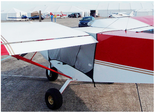
Zenith 701 Spandex FlyAway Travel Canopy Cover

This cover type is made from Silver Acrylic Sunbrella canvas and is 100% lined with a soft and smooth microfiber. Bruce's Custom Covers developed this material combination especially for aircraft protection. The outer material is medium weight and treated for water resistance, UV resistance and anti-static buildup. The inner lining is a very soft and smooth microfiber to prevent scratching. The material is very reflective, and tests show that the cabin interior temperature can be reduced to near-ambient temperature on the hottest of days. It is water, ice and snow repellent, yet breathable to allow moisture to escape from between the cover and the aircraft surface.