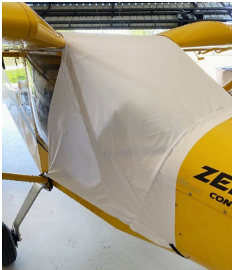
Zenith 750 Windshield Cover