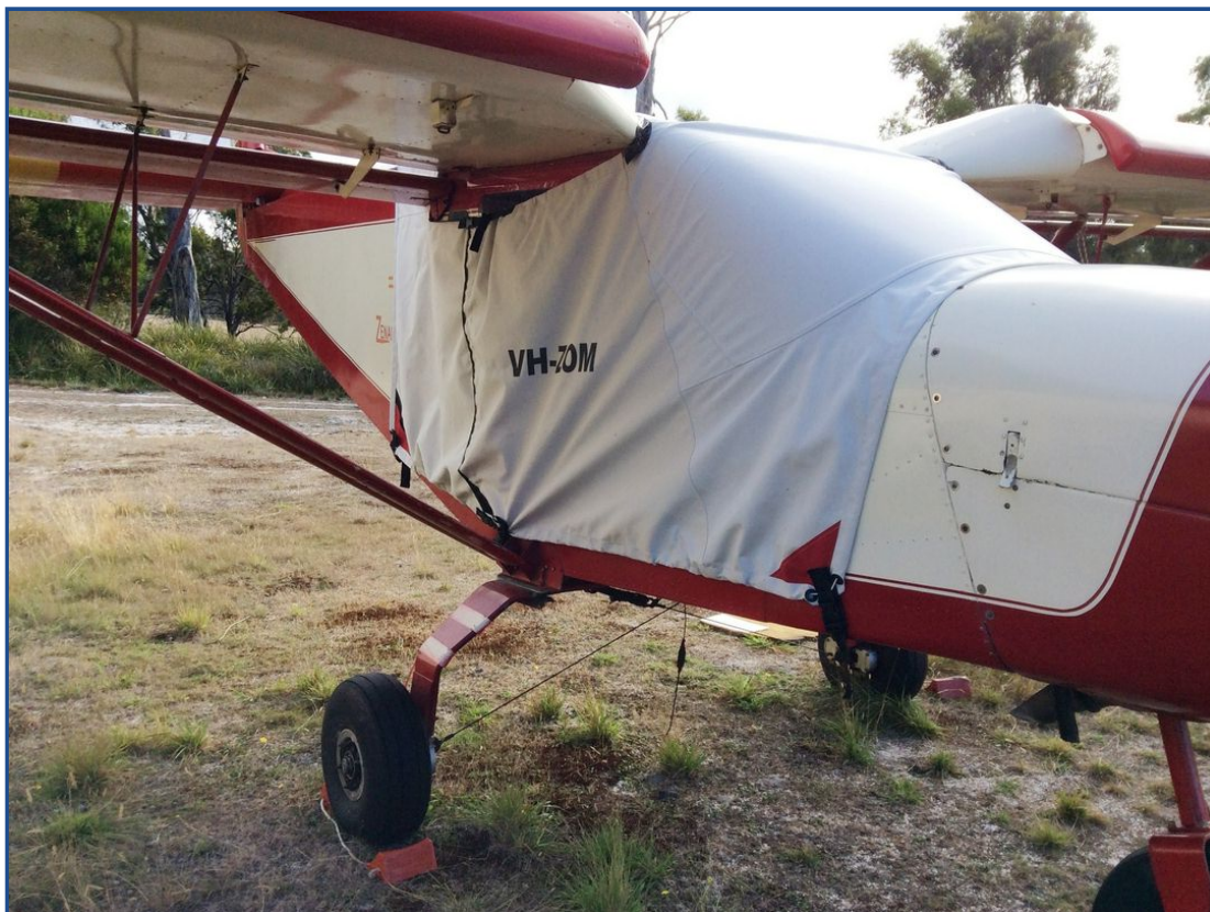
Zenith Z801 Canopy Cover