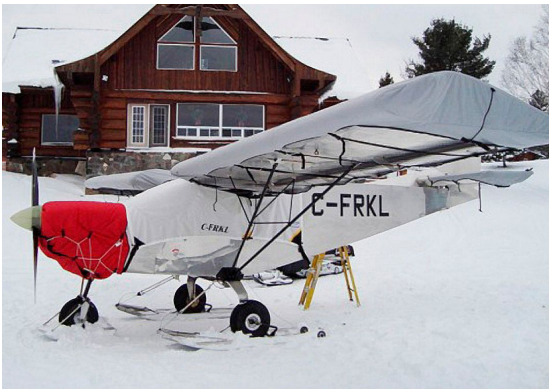
Zenith 801 Insulated Engine, Canopy, Wing & Tail Covers