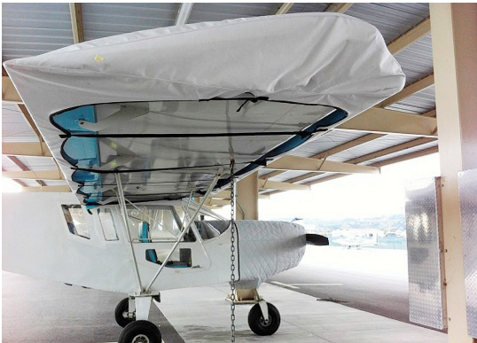
Zenith 801 Wing & Insulated Engine Covers

WINTER USE MATERIAL - Made with Solution-Dyed Polyester fabric, this option is intended for seasonal use to aid in deicing, rain mitigation, or for occasional travel. The material is lighter and more compact, but more susceptible to UV damage and may have a shorter useful life if used continuously outside than the all-year use material.