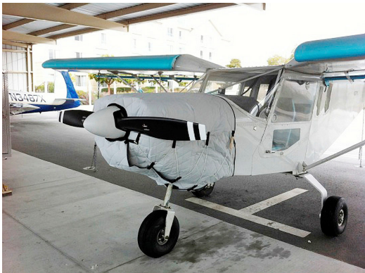
Zenith 801 Insulated Engine Cover