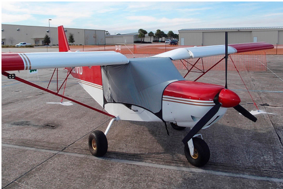
Zenith 701 Spandex FlyAway Travel Canopy Cover

This cover type is made from Silver Acrylic Sunbrella canvas and is 100% lined with a soft and smooth microfiber. Bruce's Custom Covers developed this material combination especially for aircraft protection. The outer material is medium weight and treated for water resistance, UV resistance and anti-static buildup. The inner lining is a very soft and smooth microfiber to prevent scratching. The material is very reflective, and tests show that the cabin interior temperature can be reduced to near-ambient temperature on the hottest of days. It is water, ice and snow repellent, yet breathable to allow moisture to escape from between the cover and the aircraft surface.