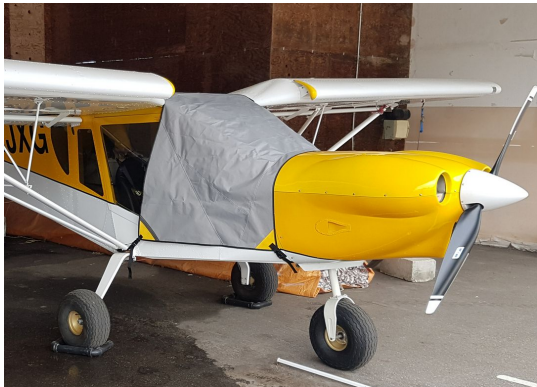
Zenair 750 Lightweight Windshield/Skylight Travel Covers

This cover type is made from Silver Acrylic Sunbrella canvas and is 100% lined with a soft and smooth microfiber. Bruce's Custom Covers developed this material combination especially for aircraft protection. The outer material is medium weight and treated for water resistance, UV resistance and anti-static buildup. The inner lining is a very soft and smooth microfiber to prevent scratching. The material is very reflective, and tests show that the cabin interior temperature can be reduced to near-ambient temperature on the hottest of days. It is water, ice and snow repellent, yet breathable to allow moisture to escape from between the cover and the aircraft surface.