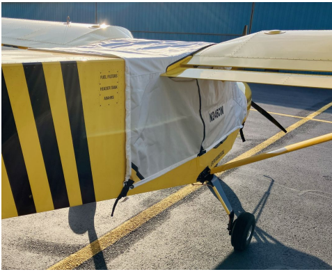
Zenith 750 Cruiser Canopy Cover (Over-The-Top Style)