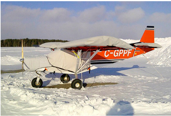
Zenith 701 Canopy, Wing, Tail & Insulated Engine Covers