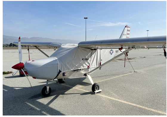
Zenair 750 & Cruiser Extended Canopy Cover