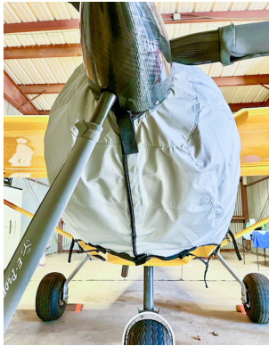
Zenith CH 750 Cruiser Engine Cover, Open Bottom

The material is very reflective, and tests show that the cabin interior temperature can be reduced to near-ambient temperature on the hottest of days. It is water, ice and snow repellent, yet breathable to allow moisture to escape from between the cover and the aircraft surface.