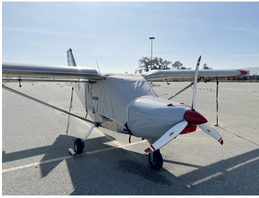
Zenair 750 & Cruiser Extended Canopy Cover