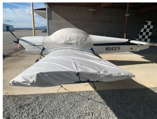
Zenith 601XL Canopy & Wing Covers