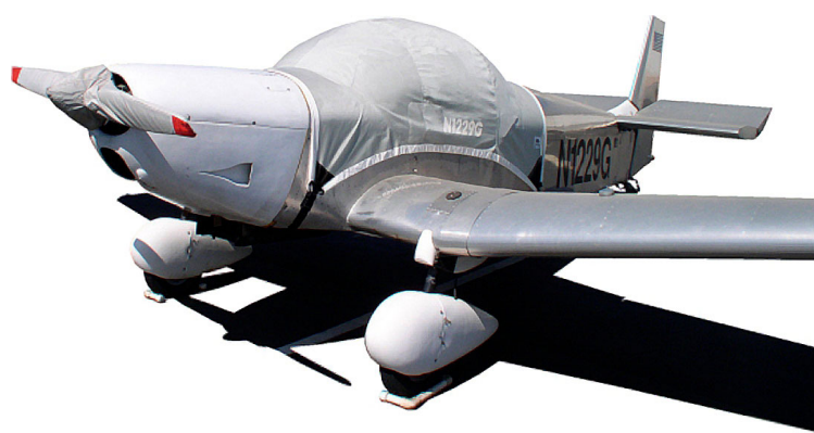
Zenith CH601 Canopy Cover & Prop Cover

This cover type is made from Silver Acrylic Sunbrella canvas and is 100% lined with a soft and smooth microfiber. Bruce's Custom Covers developed this material combination especially for aircraft protection. The outer material is medium weight and treated for water resistance, UV resistance and anti-static buildup. The inner lining is a very soft and smooth microfiber to prevent scratching. The material is very reflective, and tests show that the cabin interior temperature can be reduced to near-ambient temperature on the hottest of days. It is water, ice and snow repellent, yet breathable to allow moisture to escape from between the cover and the aircraft surface.