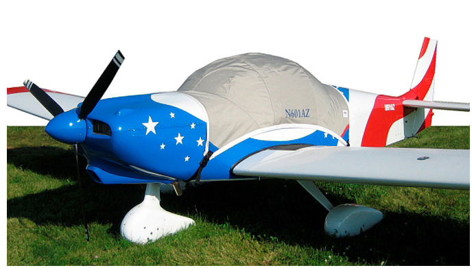
Zenith CH601 Canopy Cover