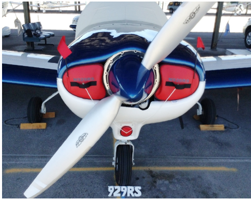
Zenith 601XL Engine Plugs, set of 3