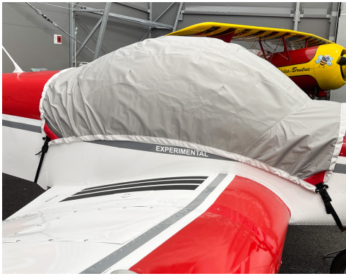
Zenair 601HD Travel Cover, Light Weight Canopy Cover, 601 Model