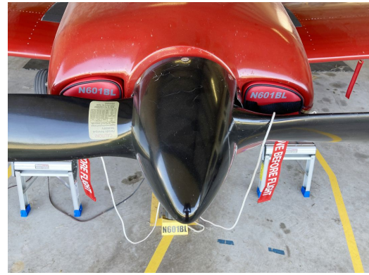
Zenith CH 601 XLB Engine Inlet Plugs