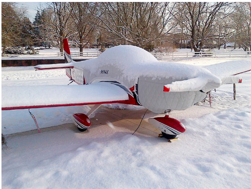
Zenith 601XL Canopy, Prop/Spinner and Insulated Engine Cover