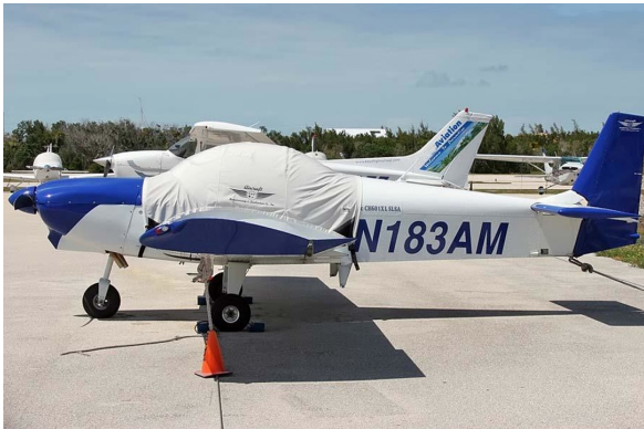
Zenith CH601 Canopy Cover

This cover type is made from Silver Acrylic Sunbrella canvas and is 100% lined with a soft and smooth microfiber. Bruce's Custom Covers developed this material combination especially for aircraft protection. The outer material is medium weight and treated for water resistance, UV resistance and anti-static buildup. The inner lining is a very soft and smooth microfiber to prevent scratching. The material is very reflective, and tests show that the cabin interior temperature can be reduced to near-ambient temperature on the hottest of days. It is water, ice and snow repellent, yet breathable to allow moisture to escape from between the cover and the aircraft surface.