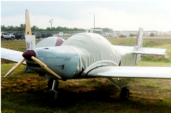
Zenith 601 XL Canopy Cover