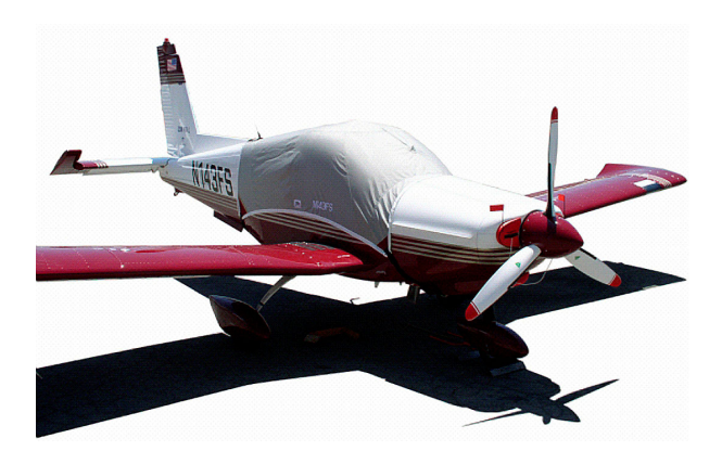
Zlin 143 Canopy Cover and Engine Plugs

This cover type is made from Silver Acrylic Sunbrella canvas and is 100% lined with a soft and smooth microfiber. Bruce's Custom Covers developed this material combination especially for aircraft protection. The outer material is medium weight and treated for water resistance, UV resistance and anti-static buildup. The inner lining is a very soft and smooth microfiber to prevent scratching. The material is very reflective, and tests show that the cabin interior temperature can be reduced to near-ambient temperature on the hottest of days. It is water, ice and snow repellent, yet breathable to allow moisture to escape from between the cover and the aircraft surface.