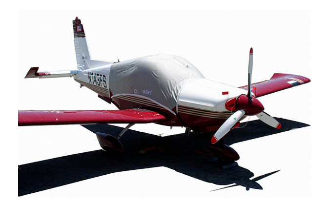
Zlin 143 Canopy Cover and Engine Plugs

Travel Covers are made with Silver Solution-Dyed Polyester fabric and only lined over the windshield to save weight. The material is lightweight and more compact for easy stowage in the aircraft. The polyester material is water resistant, but only intended for occasional use outside. We also have an ultra lightweight material available for fitted hangar dust covers. For daily outdoor use, the non-travel Sunbrella Cover is the best choice.