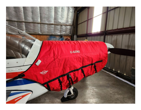
ZLIN 142C Insulated Engine Cover