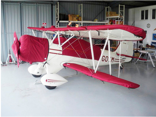
Waco UPF-7 Canopy, Wings, Stab's, Engine, Prop Covers