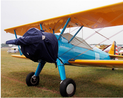
Stearman Canopy, Engine & Prop Covers

This cover type is made from Silver Acrylic Sunbrella canvas and is 100% lined with a soft and smooth microfiber. Bruce's Custom Covers developed this material combination especially for aircraft protection. The outer material is medium weight and treated for water resistance, UV resistance and anti-static buildup. The inner lining is a very soft and smooth microfiber to prevent scratching. The material is very reflective, and tests show that the cabin interior temperature can be reduced to near-ambient temperature on the hottest of days. It is water, ice and snow repellent, yet breathable to allow moisture to escape from between the cover and the aircraft surface.