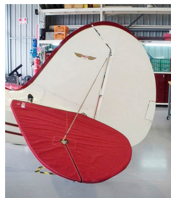
Waco UPF-7 Horizontal Stab. Cover