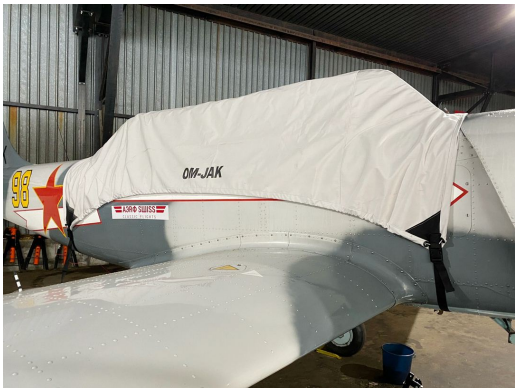
Yak 52 Canopy Cover