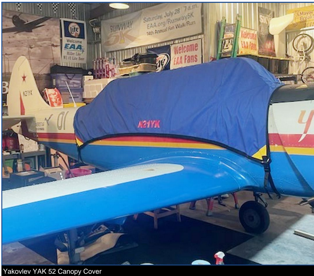
Yakovlev YAK 52 Canopy Cover