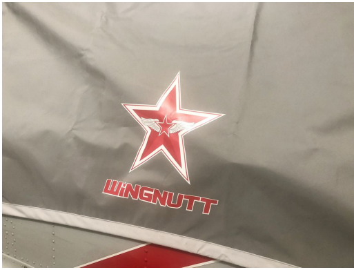
YAK 52TW Lightweight Travel Cover with Custom Artwork Imprint