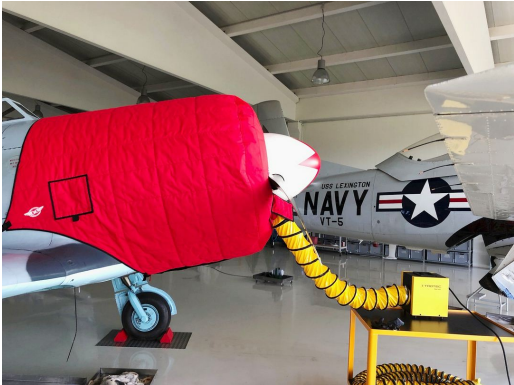
Yak 11 Insulated Engine Cover