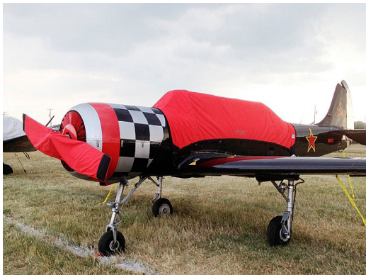
Yak 52 Canopy Cover & Prop Cover

This cover type is made from Silver Acrylic Sunbrella canvas and is 100% lined with a soft and smooth microfiber. Bruce's Custom Covers developed this material combination especially for aircraft protection. The outer material is medium weight and treated for water resistance, UV resistance and anti-static buildup. The inner lining is a very soft and smooth microfiber to prevent scratching. The material is very reflective, and tests show that the cabin interior temperature can be reduced to near-ambient temperature on the hottest of days. It is water, ice and snow repellent, yet breathable to allow moisture to escape from between the cover and the aircraft surface.