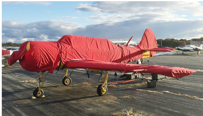
Yak 52 Full Cover Set

WINTER USE MATERIAL - Made with Solution-Dyed Polyester fabric, this option is intended for seasonal use to aid in deicing, rain mitigation, or for occasional travel. The material is lighter and more compact, but more susceptible to UV damage and may have a shorter useful life if used continuously outside than the all-year use material.