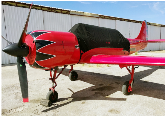
Yakovlev Yak 52 Travel Cover