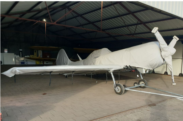
Yak 50 Complete Cover Set

WINTER USE MATERIAL - Made with Solution-Dyed Polyester fabric, this option is intended for seasonal use to aid in deicing, rain mitigation, or for occasional travel. The material is lighter and more compact, but more susceptible to UV damage and may have a shorter useful life if used continuously outside than the all-year use material.