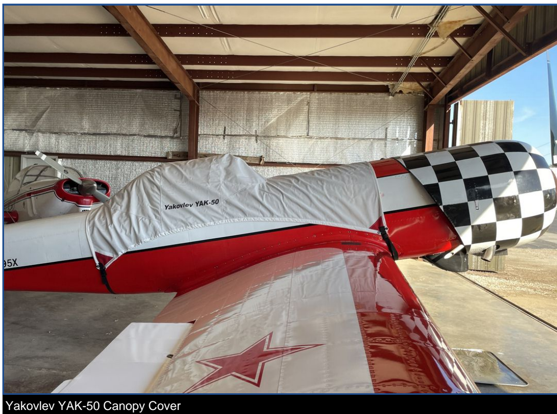
Yakovlev YAK-50 Canopy Cover