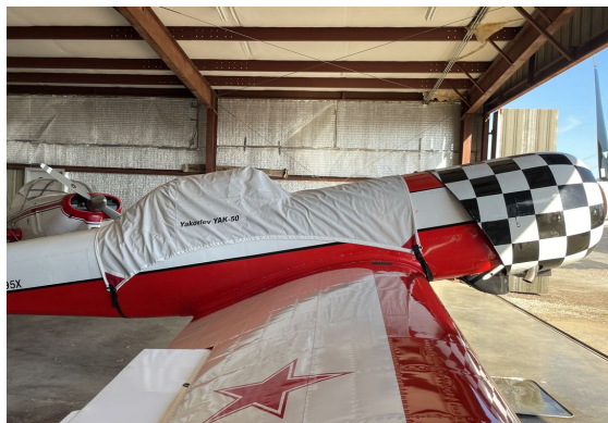
Yakovlev YAK-50 Canopy Cover

This cover type is made from Silver Acrylic Sunbrella canvas and is 100% lined with a soft and smooth microfiber. Bruce's Custom Covers developed this material combination especially for aircraft protection. The outer material is medium weight and treated for water resistance, UV resistance and anti-static buildup. The inner lining is a very soft and smooth microfiber to prevent scratching. The material is very reflective, and tests show that the cabin interior temperature can be reduced to near-ambient temperature on the hottest of days. It is water, ice and snow repellent, yet breathable to allow moisture to escape from between the cover and the aircraft surface.