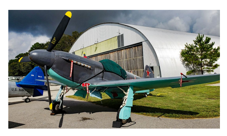
Yakovlev Yak 3 Oil Cooler Inlet Plugs (In Wing Root)