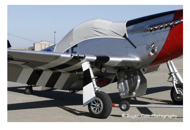
North American P-51 Canopy Cover

Engine Inlet Plugs are custom fit for your Yakovlev Yak 3 intakes, made with heavy-duty vinyl material, and stuffed with a single block of sculpted urethane foam. Each plug has a zipper that allows the foam to be removed and dried if necessary. Engine plugs have warning flags that are visible from the cockpit or 'remove before flight' streamers sewn onto the face of the plugs. Most plugs are imprinted with the aircraft registration number in black for an extra charge. Storage bag NOT included. Engine plugs may be inserted after flight when the engine is still warm. Engine Inlet Plugs are commonly referred to as Cowl Plugs, Intake Plugs, Cowl Blocks, Engine Blocks, and Engine Bungs.