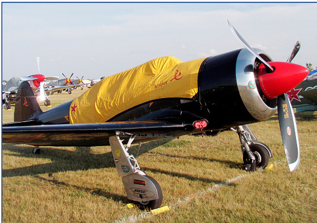
Yak 11 Canopy Cover, Plugs &amp; Pitot Covers