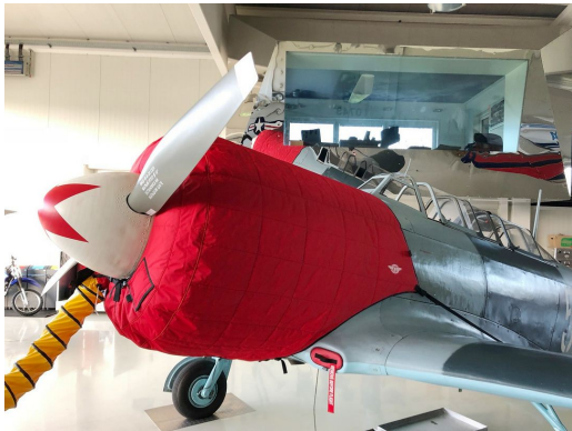
Yak 11 Insulated Engine Cover & Oil Cooler Inlet Plug