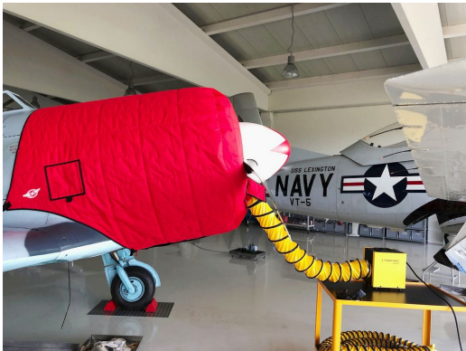
Yak 11 Insulated Engine Cover

Engine Inlet Plugs are custom fit for your Yakovlev Yak 11 intakes, made with heavy-duty vinyl material, and stuffed with a single block of sculpted urethane foam. Each plug has a zipper that allows the foam to be removed and dried if necessary. Engine plugs have warning flags that are visible from the cockpit or 'remove before flight' streamers sewn onto the face of the plugs. Most plugs are imprinted with the aircraft registration number in black for an extra charge. Storage bag NOT included. Engine plugs may be inserted after flight when the engine is still warm. Engine Inlet Plugs are commonly referred to as Cowl Plugs, Intake Plugs, Cowl Blocks, Engine Blocks, and Engine Bungs.