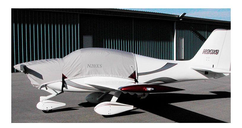
Canopy/Engine and Prop/Spinner Covers (tri-gear model)

Travel Covers are made with Silver Solution-Dyed Polyester fabric and only lined over the windshield to save weight. The material is lightweight and more compact for easy stowage in the aircraft. The polyester material is water resistant, but only intended for occasional use outside. We also have an ultra lightweight material available for fitted hangar dust covers. For daily outdoor use, the non-travel Sunbrella Cover is the best choice.