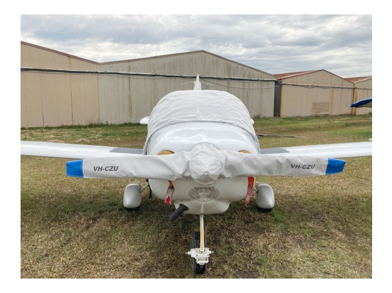
XL-2 PROPELLOR/SPINNER COVER

This cover type is made from Silver Acrylic Sunbrella canvas and is 100% lined with a soft and smooth microfiber. Bruce's Custom Covers developed this material combination especially for aircraft protection. The outer material is medium weight and treated for water resistance, UV resistance and anti-static buildup. The inner lining is a very soft and smooth microfiber to prevent scratching. The material is very reflective, and tests show that the cabin interior temperature can be reduced to near-ambient temperature on the hottest of days. It is water, ice and snow repellent, yet breathable to allow moisture to escape from between the cover and the aircraft surface.