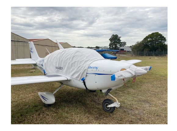
XL-2 CANOPY COVER