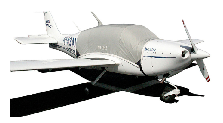
XL-2 Canopy Cover