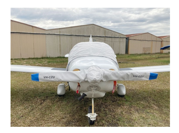
XL-2 PROPELLOR/SPINNER COVER

This cover type is made from Silver Acrylic Sunbrella canvas and is 100% lined with a soft and smooth microfiber. Bruce's Custom Covers developed this material combination especially for aircraft protection. The outer material is medium weight and treated for water resistance, UV resistance and anti-static buildup. The inner lining is a very soft and smooth microfiber to prevent scratching. The material is very reflective, and tests show that the cabin interior temperature can be reduced to near-ambient temperature on the hottest of days. It is water, ice and snow repellent, yet breathable to allow moisture to escape from between the cover and the aircraft surface.