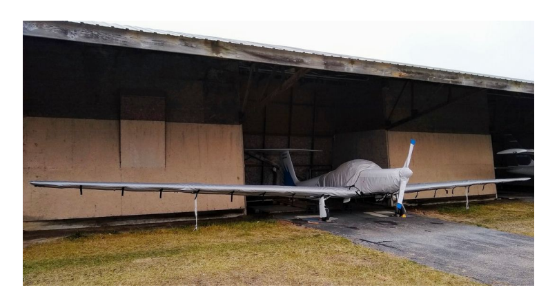
Aeromot Ximango Extended Canopy Cover, Engine, Prop & Wing Covers