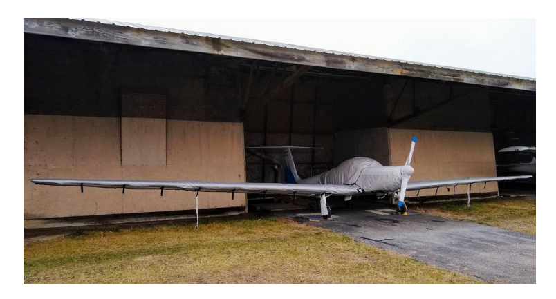
Grob 109 Canopy/Engine w/ extension to tail, Wing, Stabilizer Aeromot Ximango Extended Canopy Cover, Engine, Prop & Wing & Prop/Spinner Covers