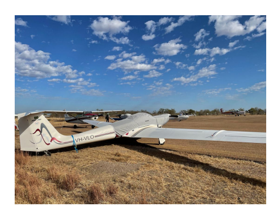
Ximango AMT Light Weight Travel Canopy/Engine Cover