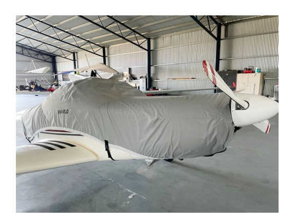
Ximango Travel Weight Canopy/Engine Cover