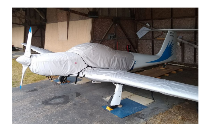
Aeromot Ximango Extended Canopy Cover, Engine, Prop & Wing Covers