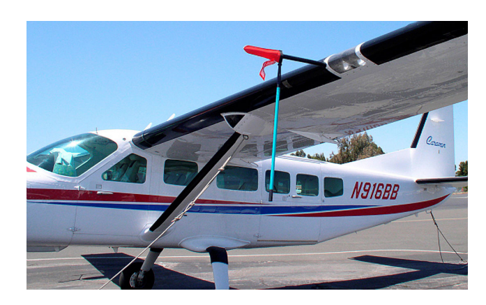
Cessna 208 Caravan Telescoping Pitot (for amphib. models)