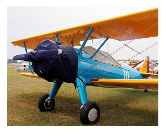
Stearman Canopy, Engine & Prop Covers