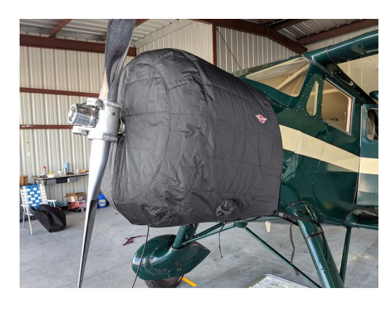
Wacon Cabin Biplane ZQC-6 Insulated Engine Cover