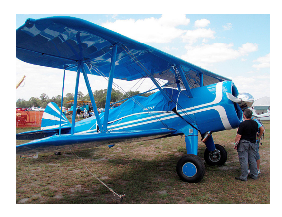
Stearman Canopy Cover (std. color is silver)