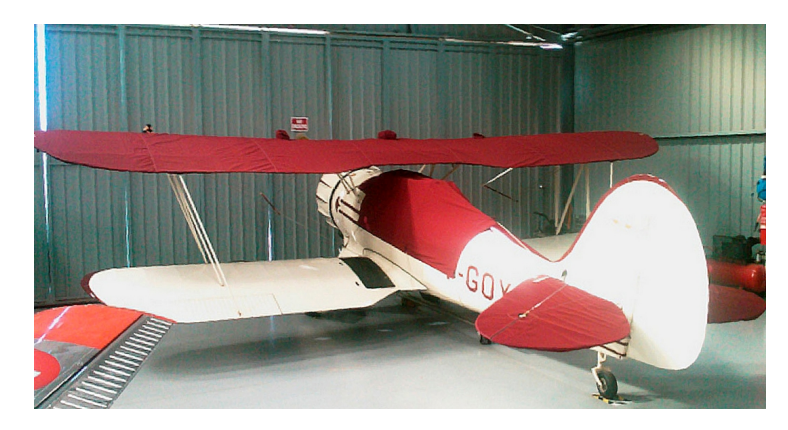
Waco UPF-7 Upper Wing Cover, Horizontal Stabilizer Cover & Canopy Cover

WINTER USE MATERIAL - Made with Solution-Dyed Polyester fabric, this option is intended for seasonal use to aid in deicing, rain mitigation, or for occasional travel. The material is lighter and more compact, but more susceptible to UV damage and may have a shorter useful life if used continuously outside than the all-year use material.