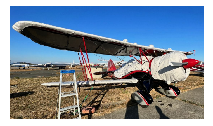
Waco YMF-5 Engine, Extended Canopy & Wing Covers