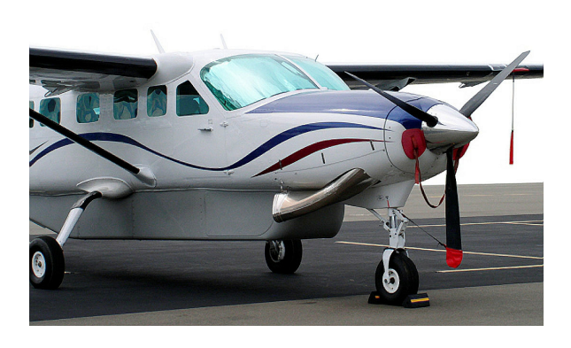
Cessna Caravan Windshield HeatShield, Plugs, Prop Ties & Pitot Cover

Waco YMF-5 Pitot Tube Covers , NOT HEAT RESISTANT TYPE, are made of Naugahyde vinyl, and are designed to cover the entire pitot assembly. Slipping over the tube, the cover tightens around the base with a Velcro strap detail. A "Remove Before Flight" streamer is attached to the cover. Heat Resistant Pitot Covers are an upgrade to this design, and help prevent the pitot cover from melting onto the tube if the pitot heat is accidentally turned on while installed. If you want the set tethered together, please let us know.