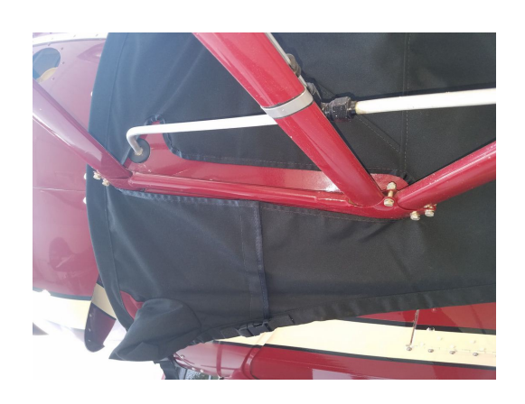
Waco UPF-7 Canopy Cover