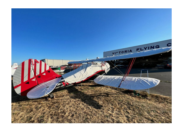
Waco YMF-5 Engine, Extended Canopy, Wing Covers & Horizontal Stab Covers