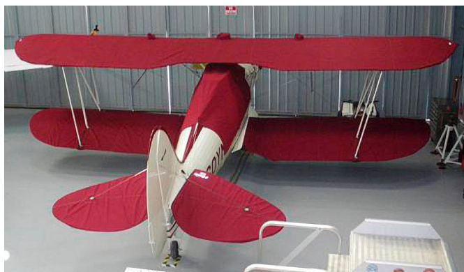
Waco AGC-8 Over-the-Top Canopy Cover Waco UPF-7 Upper/Lower Wing Cover, Horizontal Stabilizer Cover, & Canopy Cover