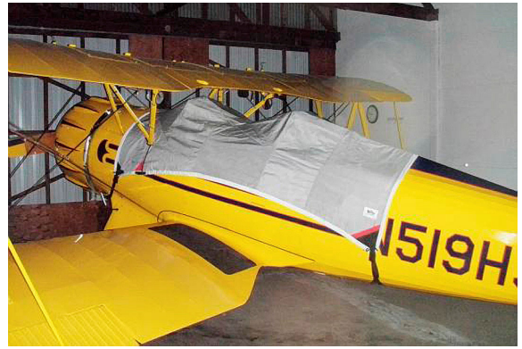
Waco YMF-5 Canopy Cover