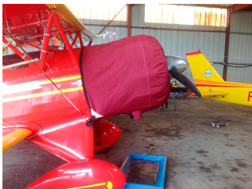
Waco Engine Cover