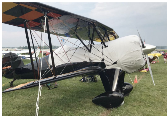
Waco Taperwing Cockpit & Engine Covers