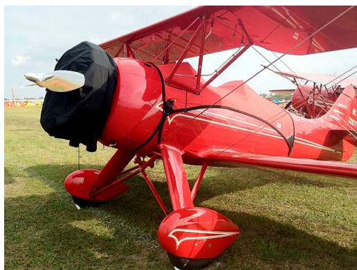
Waco UPF-7 Canopy & Engine Cover