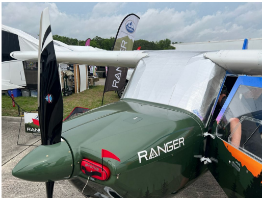
Vashon Ranger VR-7 Engine Plugs, Windshield HeatShield

window framing. It folds up flat and easily stores in the included storage sleeve. Some designs may require velcro and suction cups or split right and left sides. A Heatshield is an excellent short-term remedy for cockpit overheating. An external fabric cover is far more effective and practical for long-term protection.