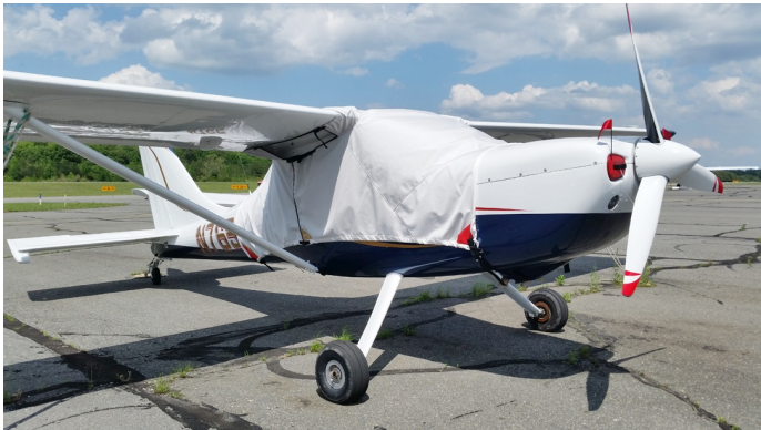
Glstar Over-Top Canopy Cover, Engine Plugs