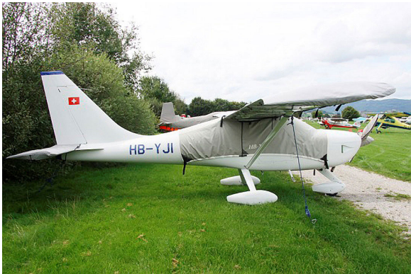
Glastar Canopy, Wings, Horizontal Stab. & Prop Covers