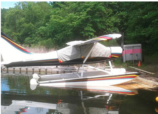
Glastar Sportsman Canopy Cover

Travel Covers are made with Silver Solution-Dyed Polyester fabric and only lined over the windshield to save weight. The material is lightweight and more compact for easy stowage in the aircraft. The polyester material is water resistant, but only intended for occasional use outside. We also have an ultra lightweight material available for fitted hangar dust covers. For daily outdoor use, the non-travel Sunbrella Cover is the best choice.