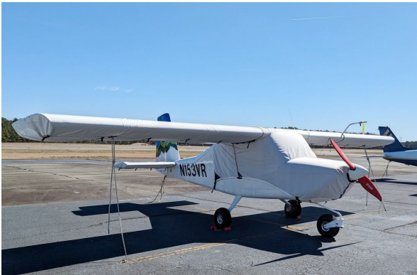
Vashon R7 Ranger Canopy/Engine, Wing & Horiz. Stab. Covers

WINTER USE MATERIAL - Made with Solution-Dyed Polyester fabric, this option is intended for seasonal use to aid in deicing, rain mitigation, or for occasional travel. The material is lighter and more compact, but more susceptible to UV damage and may have a shorter useful life if used continuously outside than the all-year use material.