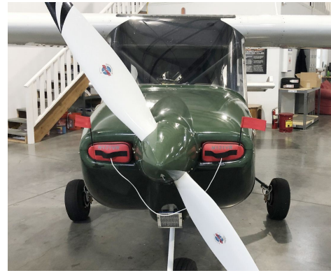
Vashon Ranger R7 Engine Plugs