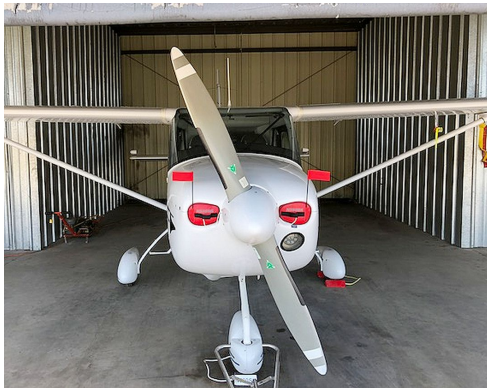
2006 OMF Symphony SA160