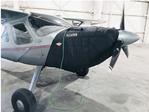
Glasair Aviation Glastar, Sportsman 2+2 Insulated Engine Cover

water resistance, UV resistance and anti-static buildup. The inner lining is a very soft and smooth microfiber to prevent scratching. The material is very reflective, and tests show that the cabin interior temperature can be reduced to near-ambient temperature on the hottest of days. It is water, ice and snow repellent, yet breathable to allow moisture to escape from between the cover and the aircraft surface.