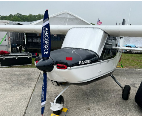
Vashon Ranger Engine Inlet Plugs