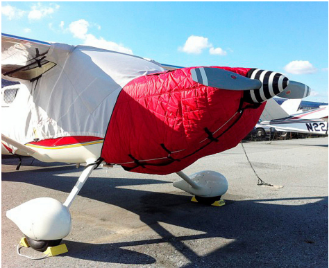
Glastar Insulated Engine Cover