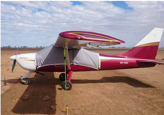
Glstar Sportsman Light Weight Travel Cover