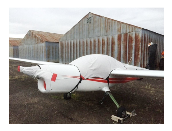
Vivat Canopy and Prop/Spinner Cover