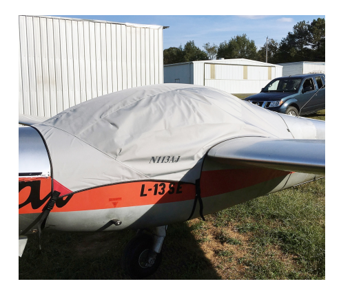
Aerotechnik L-13 Travel Cover