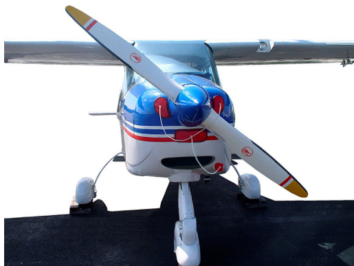
Tecnam Bravo Engine Plugs

Engine Inlet Plugs are custom fit for your Vulcanair V1.0 intakes, made with heavy-duty vinyl material, and stuffed with a single block of sculpted urethane foam. Each plug has a zipper that allows the foam to be removed and dried if necessary. Engine plugs have warning flags that are visible from the cockpit or 'remove before flight' streamers sewn onto the face of the plugs. Most plugs are imprinted with the aircraft registration number in black for an extra charge. Storage bag NOT included. Engine plugs may be inserted after flight when the engine is still warm. Engine Inlet Plugs are commonly referred to as Cowl Plugs, Intake Plugs, Cowl Blocks, Engine Blocks, and Engine Bungs.