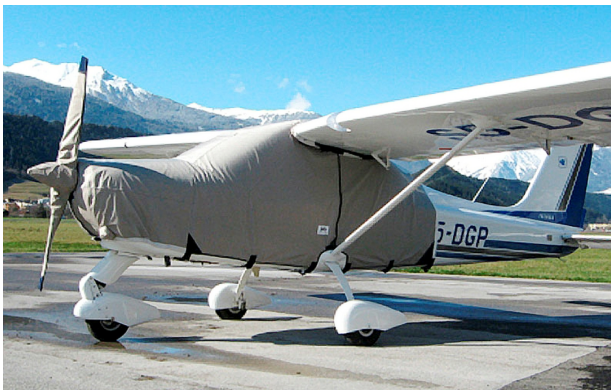
Tecnam Echo Extended Canopy, Engine, Prop Covers

Travel Covers are made with Silver Solution-Dyed Polyester fabric and only lined over the windshield to save weight. The material is lightweight and more compact for easy stowage in the aircraft. The polyester material is water resistant, but only intended for occasional use outside. We also have an ultra lightweight material available for fitted hangar dust covers. For daily outdoor use, the non-travel Sunbrella Cover is the best choice.