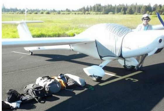
Distar Sundancer Travel Weight Canopy Cover