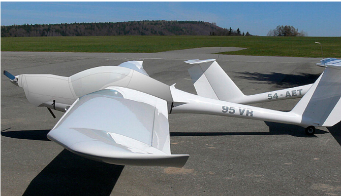
Lambda Canopy/Engine Cover (illustration)