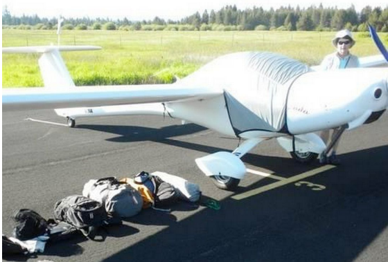
Distar Sundancer Travel Weight Canopy Cover