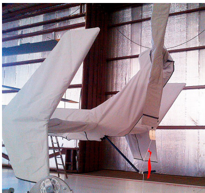
Tail Rotor Cover & Tailboom, Vertical Pylon & Stabilizers Cover