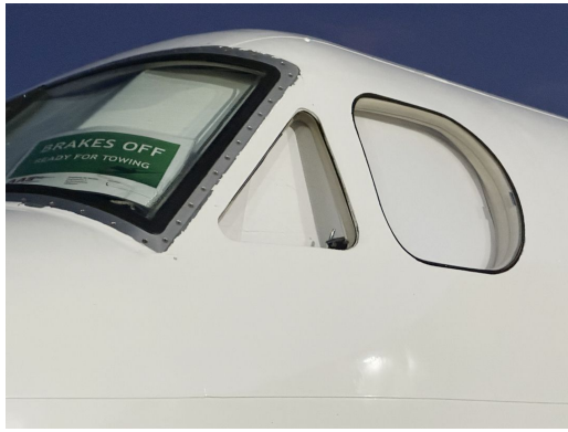
Beechcraft B200 Cockpit Heatshields