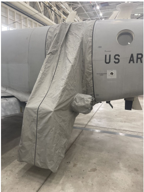
King Air Airstair Door Cover