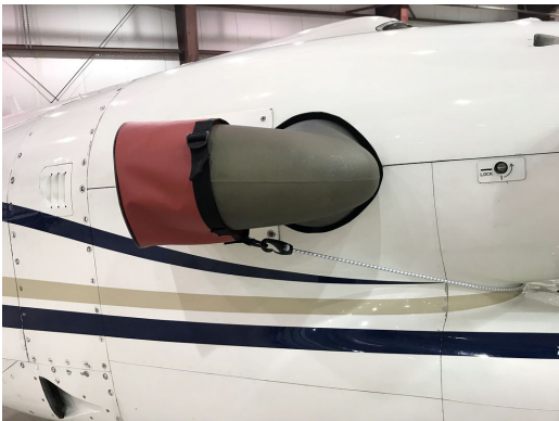
Beech King Air 350 Exhaust Covers