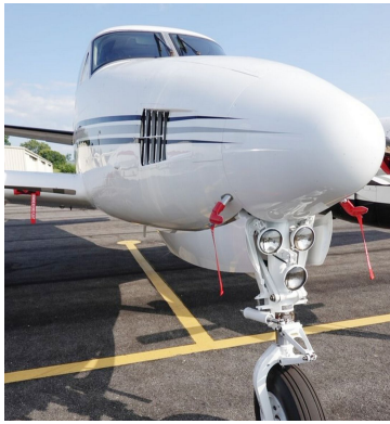
Beech King Air C90 Pitot Covers, Heat Exchanger Plugs