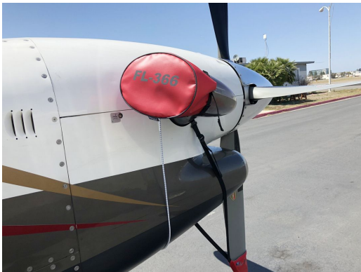
Beech King Air 350 Prop Tie-Downs/Exhaust Covers Combination

The material is very reflective, and tests show that the cabin interior temperature can be reduced to near-ambient temperature on the hottest of days. It is water, ice and snow repellent, yet breathable to allow moisture to escape from between the cover and the aircraft surface.