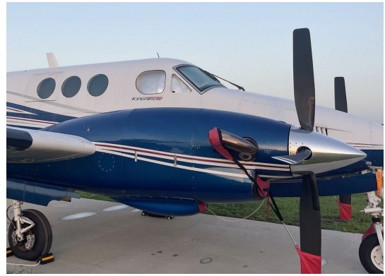
Beech King Air C90 Cockpit HeatShields