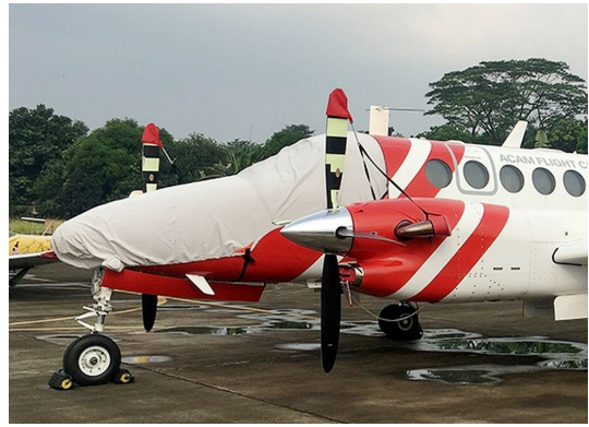
Beech King Air 200 Cockpit/Nose Cover