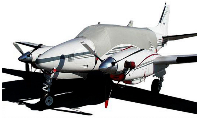
King Air Canopy Cover, Engine Plugs, Prop-Tie/Exhaust Covers