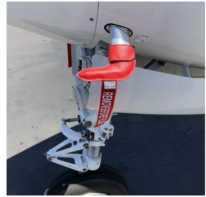
Beech King Air Pitot Covers