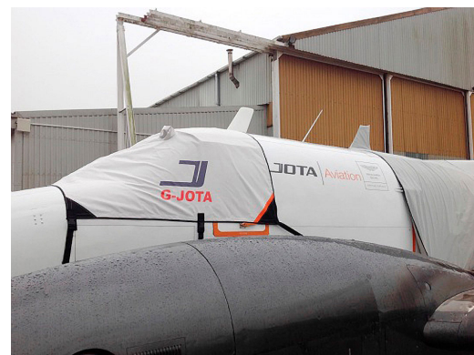
King Air Windshield/Cockpit Cover