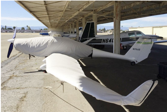
Phoenix Air U-15 Canopy/Engine, Wing & Horizontal Stabilizer Covers

WINTER USE MATERIAL - Made with Solution-Dyed Polyester fabric, this option is intended for seasonal use to aid in deicing, rain mitigation, or for occasional travel. The material is lighter and more compact, but more susceptible to UV damage and may have a shorter useful life if used continuously outside than the all-year use material.