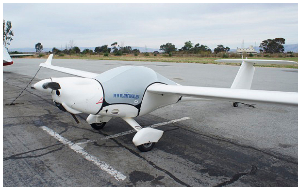
Lambda Canopy Cover