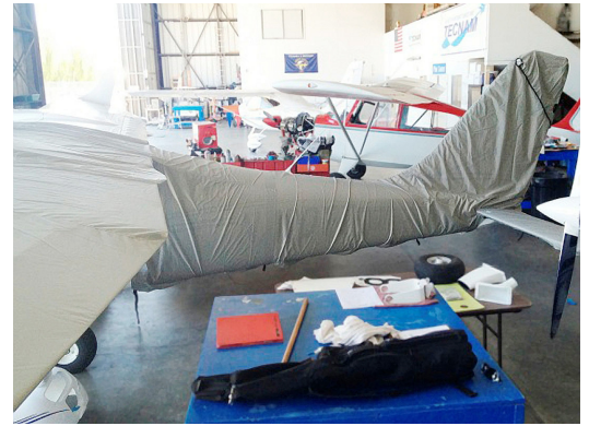
Tecnam Twin Wing & Empennage Covers