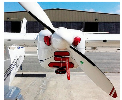
Tecnam P2006T Engine Plugs