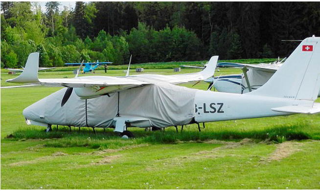
Tecnam Twin Extended Canopy/Nose Cover