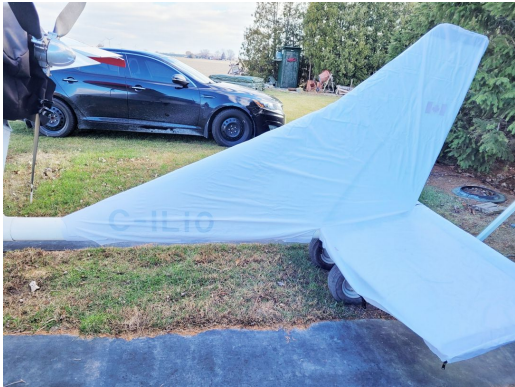
Titan Tornado Empennage Cover, test fit cover

WINTER USE MATERIAL - Made with Solution-Dyed Polyester fabric, this option is intended for seasonal use to aid in deicing, rain mitigation, or for occasional travel. The material is lighter and more compact, but more susceptible to UV damage and may have a shorter useful life if used continuously outside than the all-year use material.