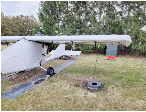
Titan Tornado Canopy/Nose, Wings & Empennage Cover