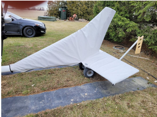
Titan Tornado Empennage Cover