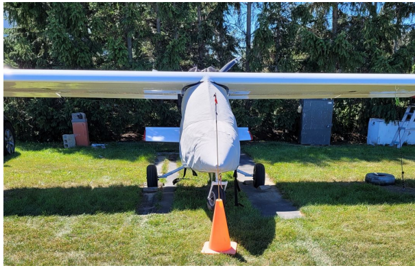
Titan Tornado Canopy/Nose Cover