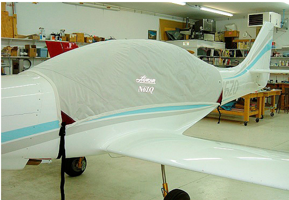
Lancair 320 Standard Canopy Cover