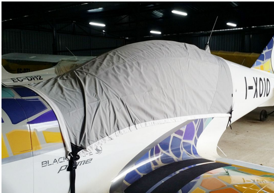
Blackshape Prime Travel Cover, Light Weight Travel Canopy Cover