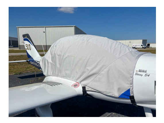
TL Ultralight TL 2000 Sting Sport, 96 Star, S3, S4 Canopy Cover

This cover type is made from Silver Acrylic Sunbrella canvas and is 100% lined with a soft and smooth microfiber. Bruce's Custom Covers developed this material combination especially for aircraft protection. The outer material is medium weight and treated for water resistance, UV resistance and anti-static buildup. The inner lining is a very soft and smooth microfiber to prevent scratching. The material is very reflective, and tests show that the cabin interior temperature can be reduced to near-ambient temperature on the hottest of days. It is water, ice and snow repellent, yet breathable to allow moisture to escape from between the cover and the aircraft surface.