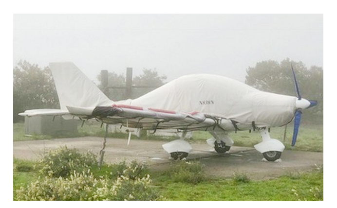
TL Sting Sport Full Cover Set