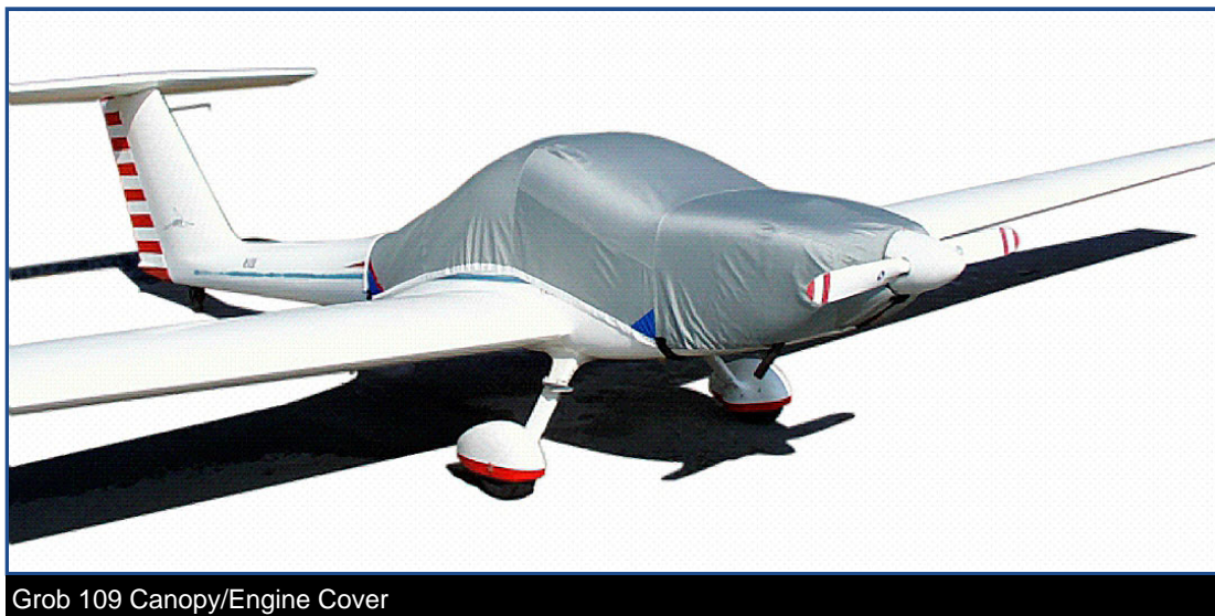
Grob 109 Canopy/Engine Cover