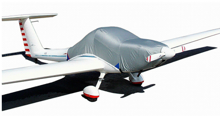
Grob 109 Canopy/Engine Cover