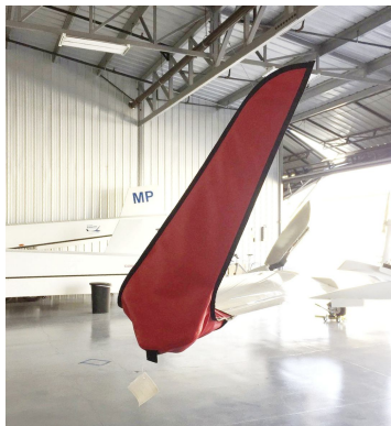
Schleicher ASH Wingtip Pads

Designed to prevent damage to the wingtip in crowded hangars or high traffic areas, these products are made of bright red Naugahyde and thickly padded with a sandwich of closed cell foam. Protects delicate winglets, casters and their housings, and soft finishes.