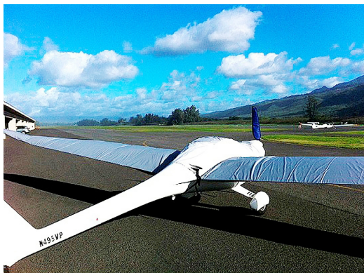
Lambada Canopy/Engine Cover and Wing Covers