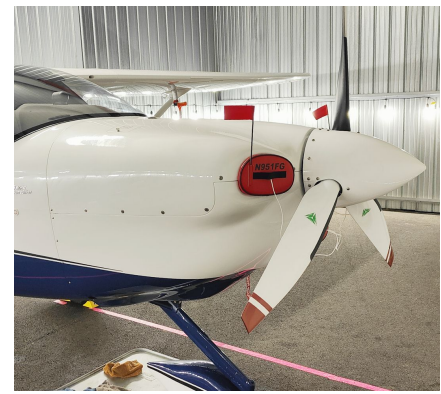
Tecnam P2010 Engine Inlet Plugs