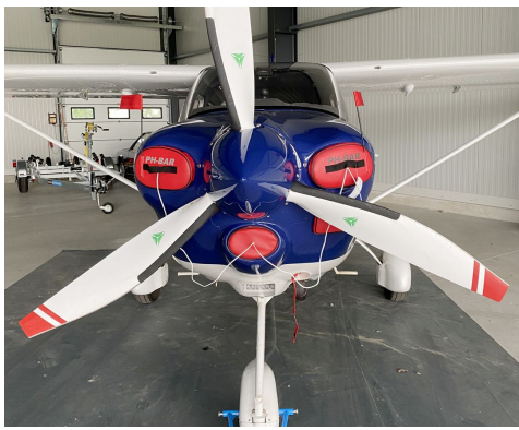
Tecnam P2010 Engine Inlet Plugs