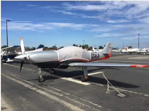
Lancair Legacy 2000 Travel Canopy Cover