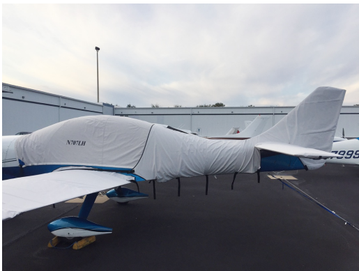
Lancair ES Wing Covers & Empennage Cover (sold separately)

WINTER USE MATERIAL - Made with Solution-Dyed Polyester fabric, this option is intended for seasonal use to aid in deicing, rain mitigation, or for occasional travel. The material is lighter and more compact, but more susceptible to UV damage and may have a shorter useful life if used continuously outside than the all-year use material.