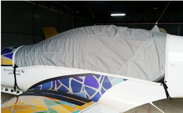
Blackshape Prime Travel Cover, Light Weight Travel Canopy Cover

Travel Covers are made with Silver Solution-Dyed Polyester fabric and only lined over the windshield to save weight. The material is lightweight and more compact for easy stowage in the aircraft. The polyester material is water resistant, but only intended for occasional use outside. We also have an ultra lightweight material available for fitted hangar dust covers. For daily outdoor use, the non-travel Sunbrella Cover is the best choice.