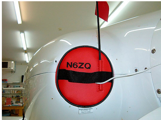
Lancair 320 Engine Inlet Plugs

Engine Inlet Plugs are custom fit for your Flying Legend Tucano R intakes, made with heavy-duty vinyl material, and stuffed with a single block of sculpted urethane foam. Each plug has a zipper that allows the foam to be removed and dried if necessary. Engine plugs have warning flags that are visible from the cockpit or 'remove before flight' streamers sewn onto the face of the plugs. Most plugs are imprinted with the aircraft registration number in black for an extra charge. Storage bag NOT included. Engine plugs may be inserted after flight when the engine is still warm. Engine Inlet Plugs are commonly referred to as Cowl Plugs, Intake Plugs, Cowl Blocks, Engine Blocks, and Engine Bungs.