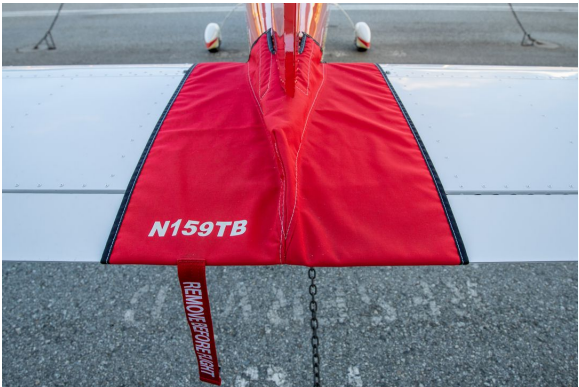
Tecnam Bravo Tailcone Cover