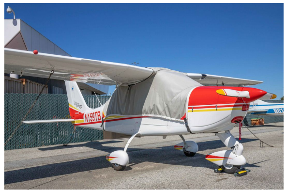
Tecnam P2004 Bravo