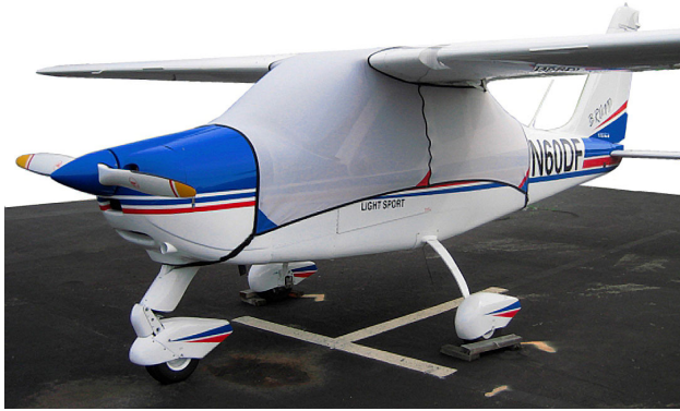
Tecnam Bravo Spandex FlyAway Travel Canopy Cover

Travel Covers are made with Silver Solution-Dyed Polyester fabric and only lined over the windshield to save weight. The material is lightweight and more compact for easy stowage in the aircraft. The polyester material is water resistant, but only intended for occasional use outside. We also have an ultra lightweight material available for fitted hangar dust covers. For daily outdoor use, the non-travel Sunbrella Cover is the best choice.