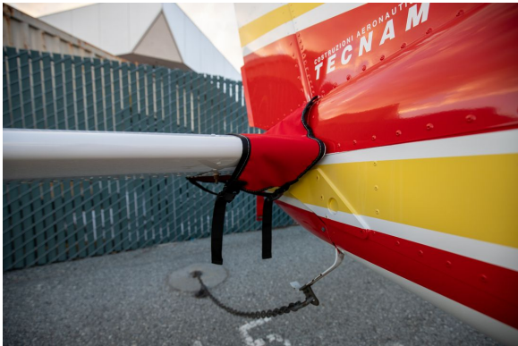
Tecnam Bravo Tailcone Cover

WINTER USE MATERIAL - Made with Solution-Dyed Polyester fabric, this option is intended for seasonal use to aid in deicing, rain mitigation, or for occasional travel. The material is lighter and more compact, but more susceptible to UV damage and may have a shorter useful life if used continuously outside than the all-year use material.