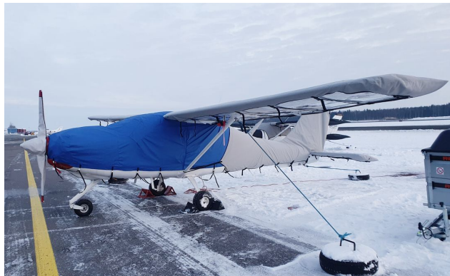
Tecnam P2010 Wing, Empennage & Prop Covers

This cover type is made from Silver Acrylic Sunbrella canvas and is 100% lined with a soft and smooth microfiber. Bruce's Custom Covers developed this material combination especially for aircraft protection. The outer material is medium weight and treated for water resistance, UV resistance and anti-static buildup. The inner lining is a very soft and smooth microfiber to prevent scratching. The material is very reflective, and tests show that the cabin interior temperature can be reduced to near-ambient temperature on the hottest of days. It is water, ice and snow repellent, yet breathable to allow moisture to escape from between the cover and the aircraft surface.