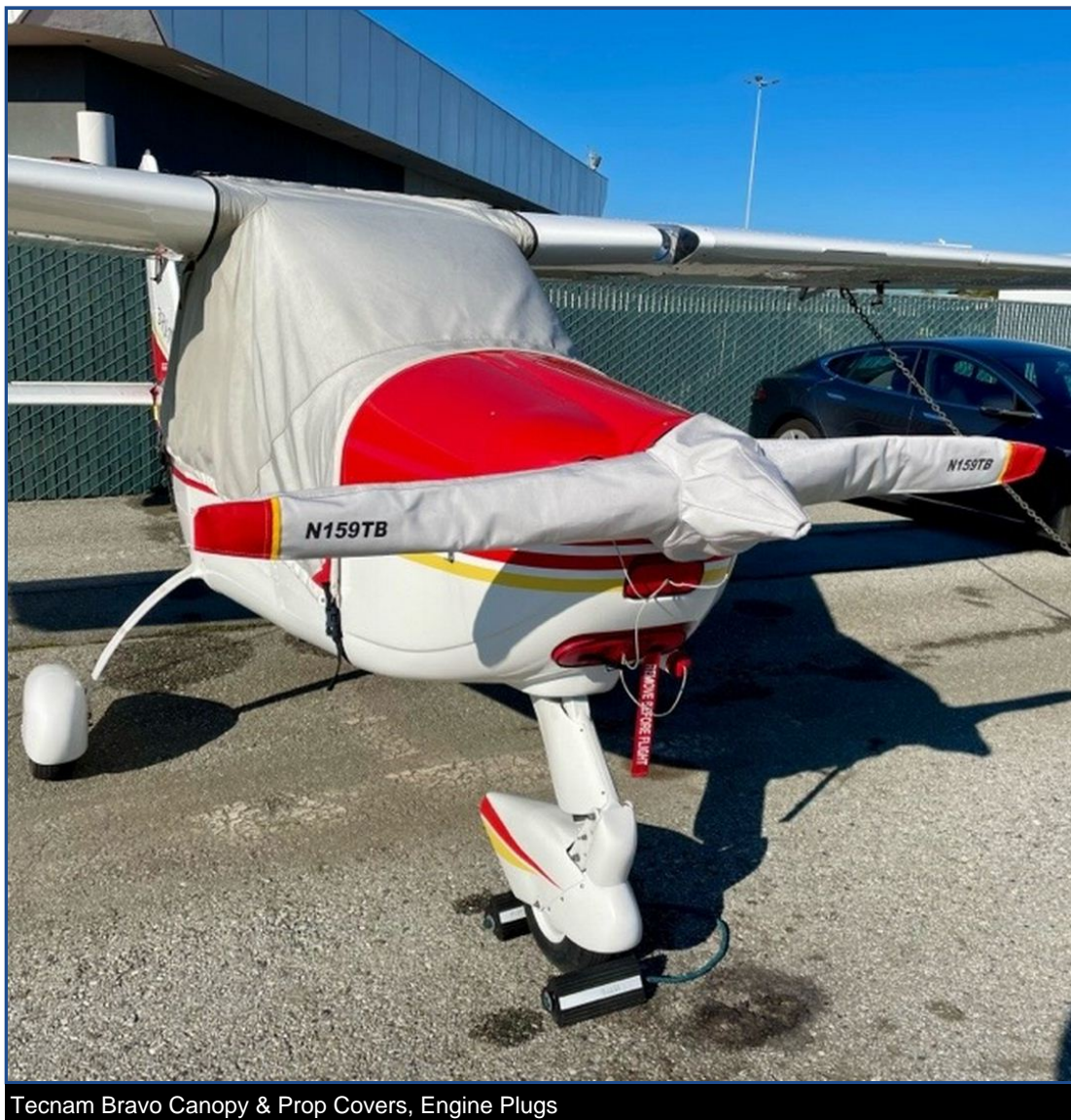
Tecnam Bravo Canopy &amp; Prop Covers, Engine Plugs