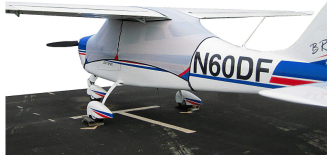
Tecnam Bravo Spandex FlyAway Travel Canopy Cover