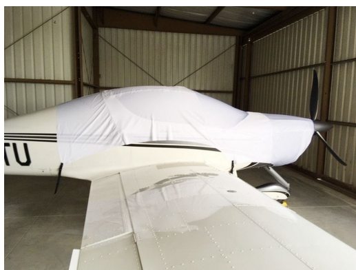
Tecnam Astore Canopy/Engine Cover, test fit cover

Travel Covers are made with Silver Solution-Dyed Polyester fabric and only lined over the windshield to save weight. The material is lightweight and more compact for easy stowage in the aircraft. The polyester material is water resistant, but only intended for occasional use outside. We also have an ultra lightweight material available for fitted hangar dust covers. For daily outdoor use, the non-travel Sunbrella Cover is the best choice.