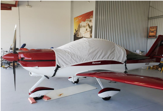
Tecnam Astore Canopy Cover

This cover type is made from Silver Acrylic Sunbrella canvas and is 100% lined with a soft and smooth microfiber. Bruce's Custom Covers developed this material combination especially for aircraft protection. The outer material is medium weight and treated for water resistance, UV resistance and anti-static buildup. The inner lining is a very soft and smooth microfiber to prevent scratching. The material is very reflective, and tests show that the cabin interior temperature can be reduced to near-ambient temperature on the hottest of days. It is water, ice and snow repellent, yet breathable to allow moisture to escape from between the cover and the aircraft surface.