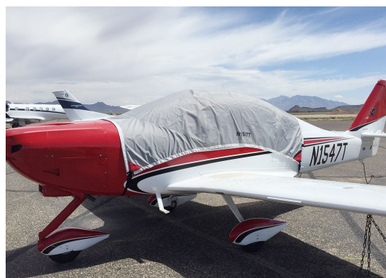
Tecnam Astore Travel Canopy Cover