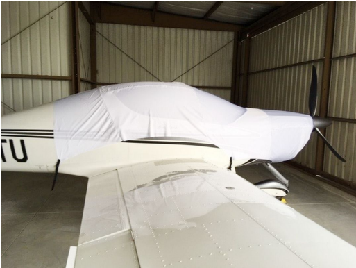
Tecnam Astore Canopy/Engine Cover, test fit cover