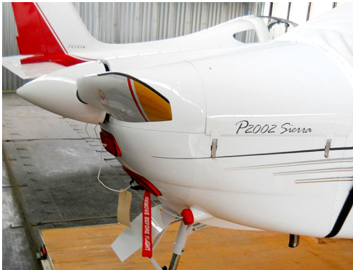
Tecnam Sierra Engine Inlet Plugs set