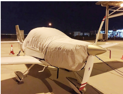
Tecnam Astore Canopy & Engine Covers