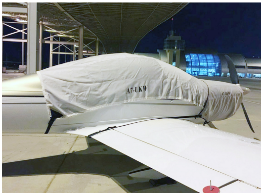
Tecnam Astore Canopy & Engine Covers

This cover type is made from Silver Acrylic Sunbrella canvas and is 100% lined with a soft and smooth microfiber. Bruce's Custom Covers developed this material combination especially for aircraft protection. The outer material is medium weight and treated for water resistance, UV resistance and anti-static buildup. The inner lining is a very soft and smooth microfiber to prevent scratching. The material is very reflective, and tests show that the cabin interior temperature can be reduced to near-ambient temperature on the hottest of days. It is water, ice and snow repellent, yet breathable to allow moisture to escape from between the cover and the aircraft surface.