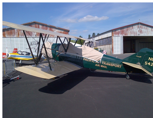
Travelair 4000 Canopy and Engine Cover