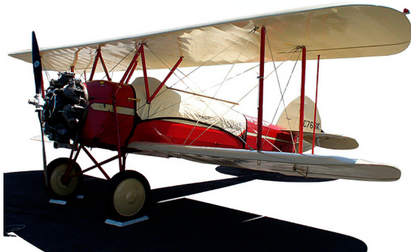
Waco 10 Canopy Cover