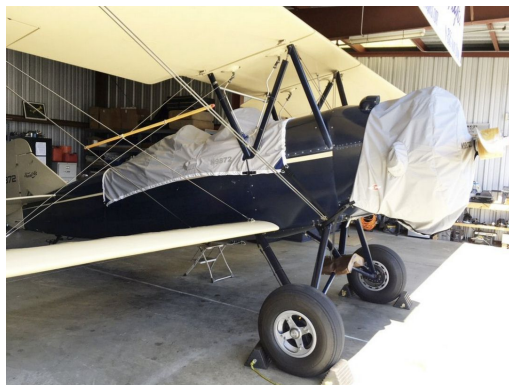
Travelair 4000 Canopy & Engine Covers, light weight travel type

Travel Covers are made with Silver Solution-Dyed Polyester fabric and only lined over the windshield to save weight. The material is lightweight and more compact for easy stowage in the aircraft. The polyester material is water resistant, but only intended for occasional use outside. We also have an ultra lightweight material available for fitted hangar dust covers. For daily outdoor use, the non-travel Sunbrella Cover is the best choice.