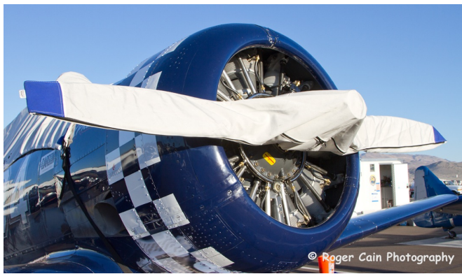
North American T6 Prop Cover