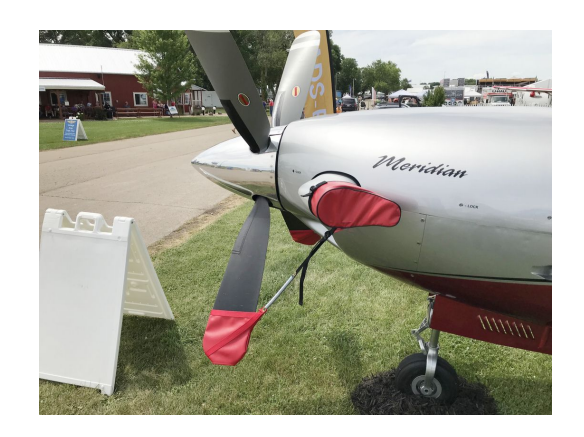
Piper Meridian Prop Tie/Exhaust Covers