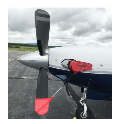
Piper Meridian Prop Tie/Exhaust Covers

This cover type is made from Silver Acrylic Sunbrella canvas and is 100% lined with a soft and smooth microfiber. Bruce's Custom Covers developed this material combination especially for aircraft protection. The outer material is medium weight and treated for water resistance, UV resistance and anti-static buildup. The inner lining is a very soft and smooth microfiber to prevent scratching. The material is very reflective, and tests show that the cabin interior temperature can be reduced to near-ambient temperature on the hottest of days. It is water, ice and snow repellent, yet breathable to allow moisture to escape from between the cover and the aircraft surface.