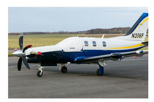
Socata TBM 700 Cockpit Cover (Not Bruce's Prop/Exhaust)

Travel Covers are made with Silver Solution-Dyed Polyester fabric and only lined over the windshield to save weight. The material is lightweight and more compact for easy stowage in the aircraft. The polyester material is water resistant, but only intended for occasional use outside. We also have an ultra lightweight material available for fitted hangar dust covers. For daily outdoor use, the non-travel Sunbrella Cover is the best choice.