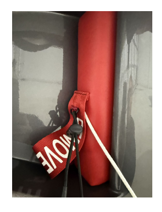
Daher TBM 960 Engine Inlet Plugs, Small NACA Inlets Only TBM Daher TBM 960 Engine Inlet Plugs, Small NACA Inlets Only TBM 900 Series (set of 3) 900 Series (set of 3)