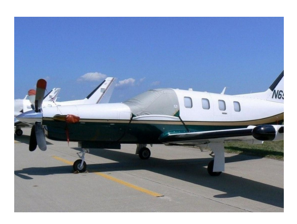
Socata TBM Cockpit Cover