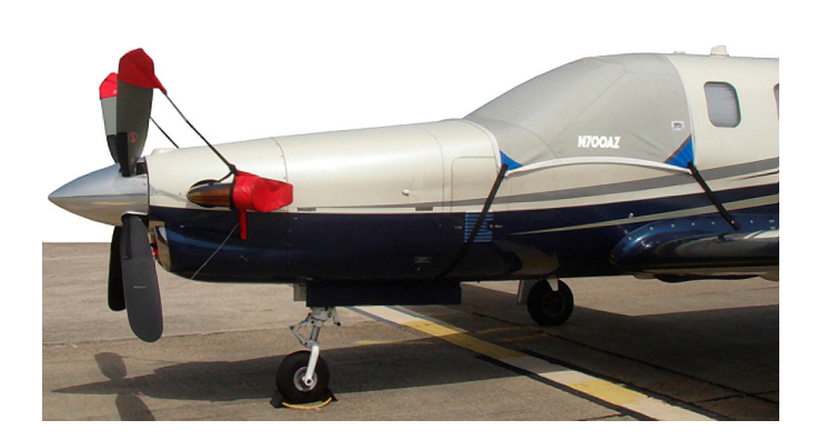
TBM700 Cockpit Cover, Engine Plugs, Prop Tie/Exhaust Covers

This cover type is made from Silver Acrylic Sunbrella canvas and is 100% lined with a soft and smooth microfiber. Bruce's Custom Covers developed this material combination especially for aircraft protection. The outer material is medium weight and treated for water resistance, UV resistance and anti-static buildup. The inner lining is a very soft and smooth microfiber to prevent scratching. The material is very reflective, and tests show that the cabin interior temperature can be reduced to near-ambient temperature on the hottest of days. It is water, ice and snow repellent, yet breathable to allow moisture to escape from between the cover and the aircraft surface.