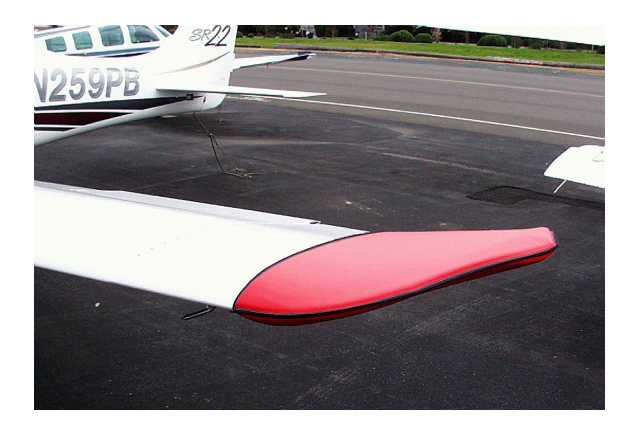
Cirrus SR-22 Wingtip Pad (also available for the Horiz. Stab.