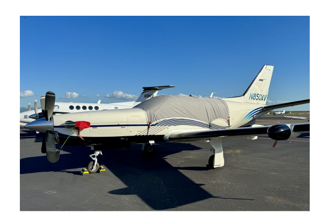
Socata TBM 850 Travel Weight Canopy Cover, Prop Tie/Exhaust Covers