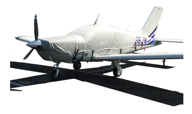
Canopy Cover & Engine Cover