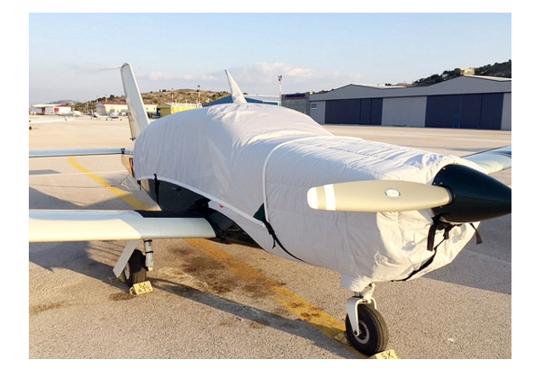
Socata TB-20 Canopy Cover, Insulated Engine Cover

This cover type is made from Silver Acrylic Sunbrella canvas and is 100% lined with a soft and smooth microfiber. Bruce's Custom Covers developed this material combination especially for aircraft protection. The outer material is medium weight and treated for water resistance, UV resistance and anti-static buildup. The inner lining is a very soft and smooth microfiber to prevent scratching. The material is very reflective, and tests show that the cabin interior temperature can be reduced to near-ambient temperature on the hottest of days. It is water, ice and snow repellent, yet breathable to allow moisture to escape from between the cover and the aircraft surface.