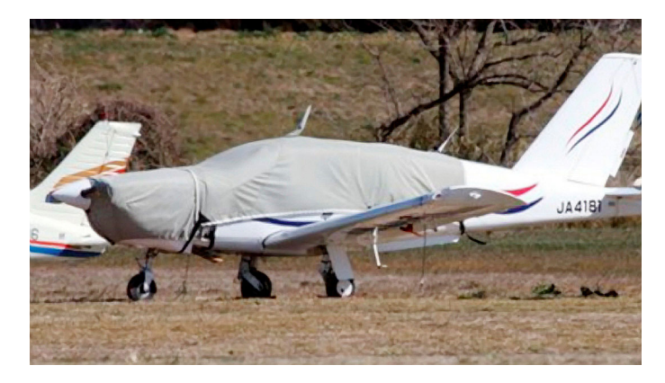
Canopy & Engine Covers

This cover type is made from Silver Acrylic Sunbrella canvas and is 100% lined with a soft and smooth microfiber. Bruce's Custom Covers developed this material combination especially for aircraft protection. The outer material is medium weight and treated for water resistance, UV resistance and anti-static buildup. The inner lining is a very soft and smooth microfiber to prevent scratching. The material is very reflective, and tests show that the cabin interior temperature can be reduced to near-ambient temperature on the hottest of days. It is water, ice and snow repellent, yet breathable to allow moisture to escape from between the cover and the aircraft surface.