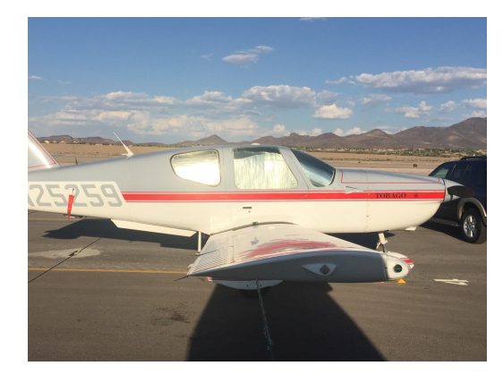
Socata TB-10 Cabin HeatShields

Windshield Heatshields are interior sunshades for an aircraft's front windshield. The product is a unique composite of closed-cell foam with a silver mylar finish. The semi-rigid design is stiff enough to stand along the inside of the windshield using sun visors or window framing. It folds up flat and easily stores in the included storage sleeve. Some designs may require velcro and suction cups or split right and left sides. A Heatshield is an excellent short-term remedy for cockpit overheating. An external fabric cover is far more effective and practical for long-term protection.