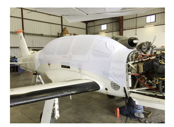
Socata TB30 Epsilon Canopy Cover, test fit cover

Travel Covers are made with Silver Solution-Dyed Polyester fabric and only lined over the windshield to save weight. The material is lightweight and more compact for easy stowage in the aircraft. The polyester material is water resistant, but only intended for occasional use outside. We also have an ultra lightweight material available for fitted hangar dust covers. For daily outdoor use, the non-travel Sunbrella Cover is the best choice.