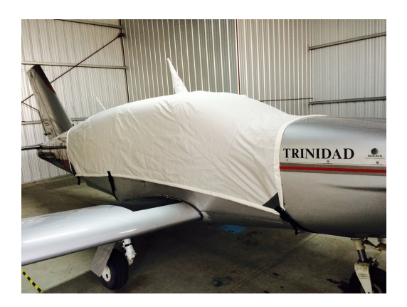
Trinidad Canopy Cover