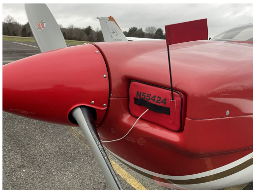
Socata Tobago Engine Plugs

Engine Inlet Plugs are custom fit for your Socata TB9-GT, Tobago: TB10-GT & TB200-GT, Trinidad: TB20-GT, TB21-GT intakes, made with heavy-duty vinyl material, and stuffed with a single block of sculpted urethane foam. Each plug has a zipper that allows the foam to be removed and dried if necessary. Engine plugs have warning flags that are visible from the cockpit or 'remove before flight' streamers sewn onto the face of the plugs. Most plugs are imprinted with the aircraft registration number in black for an extra charge. Storage bag NOT included. Engine plugs may be inserted after flight when the engine is still warm. Engine Inlet Plugs are commonly referred to as Cowl Plugs, Intake Plugs, Cowl Blocks, Engine Blocks, and Engine Bungs.