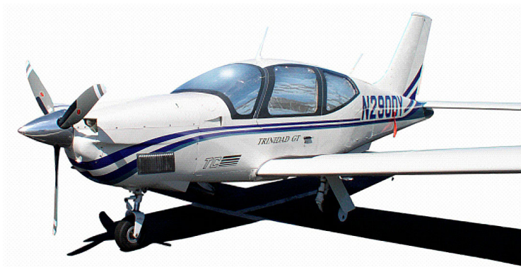
Socata TB20 HeatShields

Windshield Heatshields are interior sunshades for an aircraft's front windshield. The product is a unique composite of closed-cell foam with a silver mylar finish. The semi-rigid design is stiff enough to stand along the inside of the windshield using sun visors or window framing. It folds up flat and easily stores in the included storage sleeve. Some designs may require velcro and suction cups or split right and left sides. A Heatshield is an excellent short-term remedy for cockpit overheating. An external fabric cover is far more effective and practical for long-term protection.