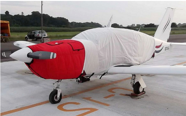
Socata TB-20/21Extended Canopy Cover and Insulated Engine Cover