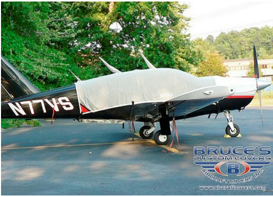
Socata TB20 Canopy Cover