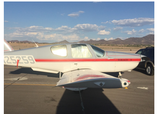
Socata TB-10 Cabin HeatShields