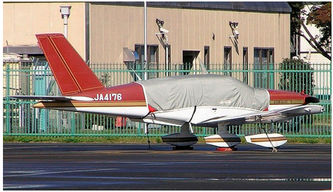
Socata TB-10 Tampico Canopy Cover