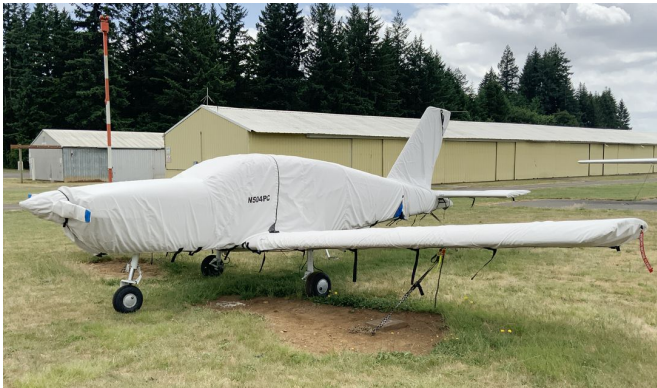
Socata Tampico TB-9C Cover Set

WINTER USE MATERIAL - Made with Solution-Dyed Polyester fabric, this option is intended for seasonal use to aid in deicing, rain mitigation, or for occasional travel. The material is lighter and more compact, but more susceptible to UV damage and may have a shorter useful life if used continuously outside than the all-year use material.