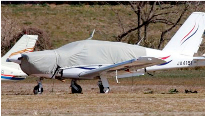
Canopy & Engine Covers

This cover type is made from Silver Acrylic Sunbrella canvas and is 100% lined with a soft and smooth microfiber. Bruce's Custom Covers developed this material combination especially for aircraft protection. The outer material is medium weight and treated for water resistance, UV resistance and anti-static buildup. The inner lining is a very soft and smooth microfiber to prevent scratching. The material is very reflective, and tests show that the cabin interior temperature can be reduced to near-ambient temperature on the hottest of days. It is water, ice and snow repellent, yet breathable to allow moisture to escape from between the cover and the aircraft surface.