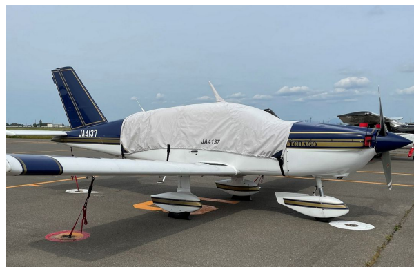
Socata TB10 Canopy Cover, Engine Plugs