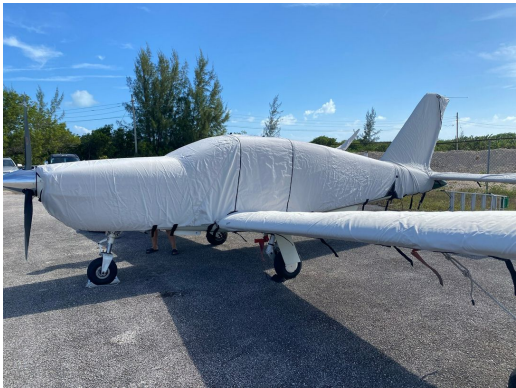
Socata TB-20 Trinidad Complete Cover Set