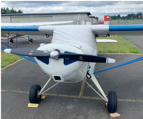
Taylorcraft Models F19 Over-The-Top Canopy Cover

This cover type is made from Silver Acrylic Sunbrella canvas and is 100% lined with a soft and smooth microfiber. Bruce's Custom Covers developed this material combination especially for aircraft protection. The outer material is medium weight and treated for water resistance, UV resistance and anti-static buildup. The inner lining is a very soft and smooth microfiber to prevent scratching. The material is very reflective, and tests show that the cabin interior temperature can be reduced to near-ambient temperature on the hottest of days. It is water, ice and snow repellent, yet breathable to allow moisture to escape from between the cover and the aircraft surface.