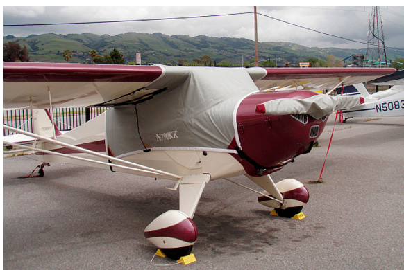
Taylorcraft Over-Top Canopy Cover