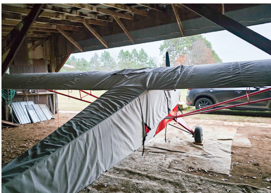
Taylorcraft BC12-D Empennage Cover (Tailboom, Vertical & Horiz Stabilizers) All Year Use