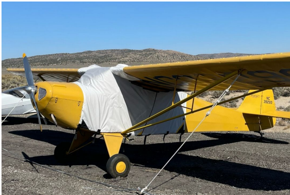
Taylorcraft BC-12D Extended Canopy Cover