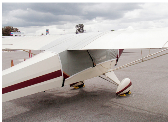
Taylorcraft Over-Top Canopy Cover