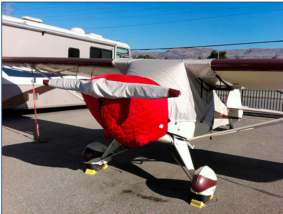
Taylorcraft Insulated Engine Cover, Prop and Canopy Covers