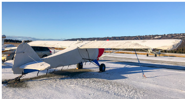
Taylorcraft Aviation Corp F19 Wing Covers

WINTER USE MATERIAL - Made with Solution-Dyed Polyester fabric, this option is intended for seasonal use to aid in deicing, rain mitigation, or for occasional travel. The material is lighter and more compact, but more susceptible to UV damage and may have a shorter useful life if used continuously outside than the all-year use material.