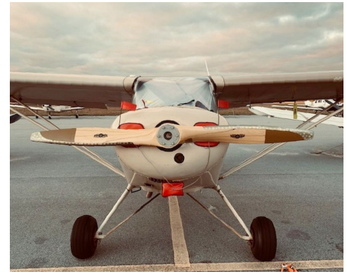
Taylorcraft Engine Inlet Plugs