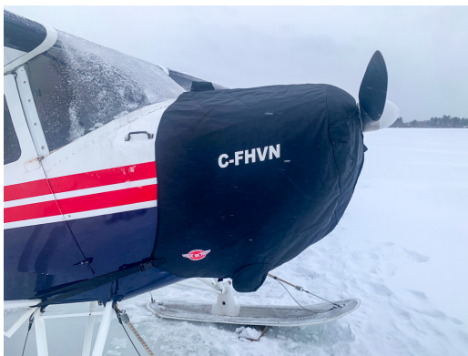
Taylorcraft Models B & F Insulated Engine Cover