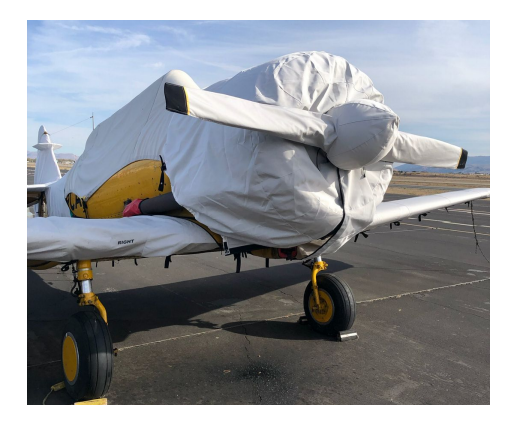
North American T6 Prop & Engine Covers

WINTER USE MATERIAL - Made with Solution-Dyed Polyester fabric, this option is intended for seasonal use to aid in deicing, rain mitigation, or for occasional travel. The material is lighter and more compact, but more susceptible to UV damage and may have a shorter useful life if used continuously outside than the all-year use material.