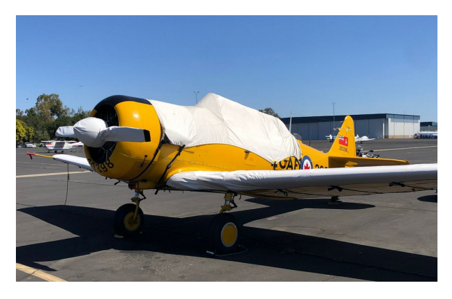
North American Harvard T6 Canopy, Prop & Wing Covers