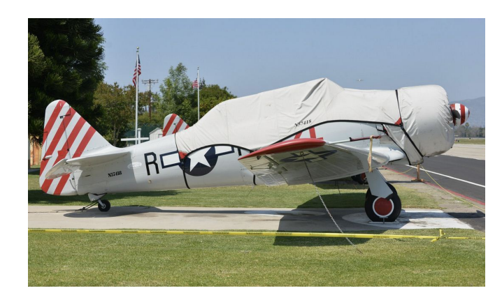
North American T6, SNJ, Harvard Canopy Cover With 48" Fwd Ext