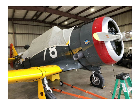
North American T6 Canopy Cover w/30" fwd bib