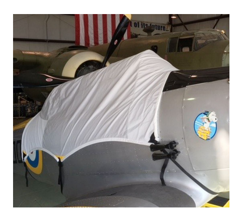
North American T6 Canopy Cover