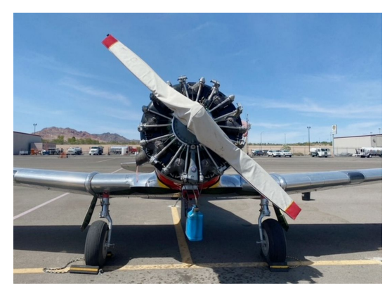
North American T6 Prop Cover

This cover type is made from Silver Acrylic Sunbrella canvas and is 100% lined with a soft and smooth microfiber. Bruce's Custom Covers developed this material combination especially for aircraft protection. The outer material is medium weight and treated for water resistance, UV resistance and anti-static buildup. The inner lining is a very soft and smooth microfiber to prevent scratching. The material is very reflective, and tests show that the cabin interior temperature can be reduced to near-ambient temperature on the hottest of days. It is water, ice and snow repellent, yet breathable to allow moisture to escape from between the cover and the aircraft surface.