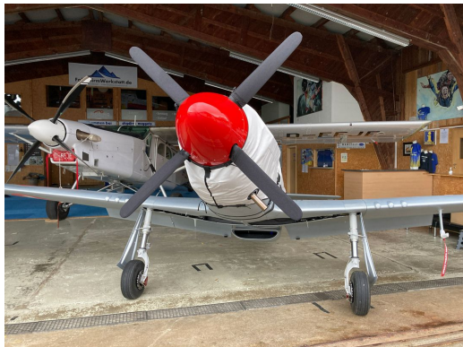
SW-51 Mustang Engine Cover

This cover type is made from Silver Acrylic Sunbrella canvas and is 100% lined with a soft and smooth microfiber. Bruce's Custom Covers developed this material combination especially for aircraft protection. The outer material is medium weight and treated for water resistance, UV resistance and anti-static buildup. The inner lining is a very soft and smooth microfiber to prevent scratching. The material is very reflective, and tests show that the cabin interior temperature can be reduced to near-ambient temperature on the hottest of days. It is water, ice and snow repellent, yet breathable to allow moisture to escape from between the cover and the aircraft surface.