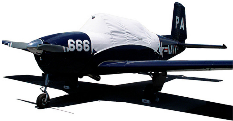
The T34 Canopy Cover