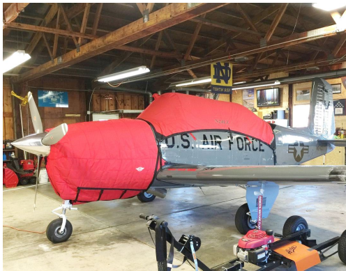
Beech T34 Mentor Canopy Cover, Insulated Engine Cover

This cover type is made from Silver Acrylic Sunbrella canvas and is 100% lined with a soft and smooth microfiber. Bruce's Custom Covers developed this material combination especially for aircraft protection. The outer material is medium weight and treated for water resistance, UV resistance and anti-static buildup. The inner lining is a very soft and smooth microfiber to prevent scratching. The material is very reflective, and tests show that the cabin interior temperature can be reduced to near-ambient temperature on the hottest of days. It is water, ice and snow repellent, yet breathable to allow moisture to escape from between the cover and the aircraft surface.