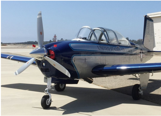
Beech T34 Engine Plugs

of the plugs. Most plugs are imprinted with the aircraft registration number in black for an extra charge. Storage bag NOT included. Engine plugs may be inserted after flight when the engine is still warm. Engine Inlet Plugs are commonly referred to as Cowl Plugs, Intake Plugs, Cowl Blocks, Engine Blocks, and Engine Bungs.