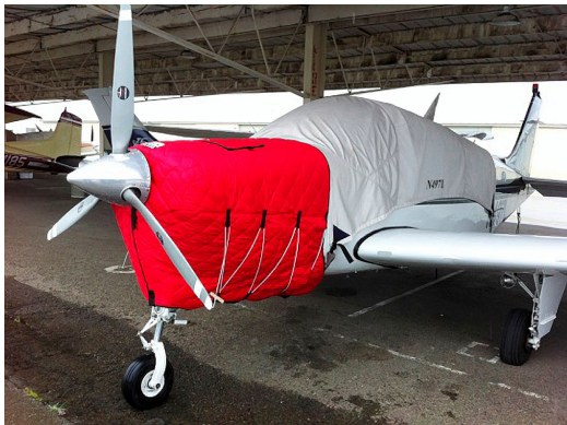
Beech Bonanza Insulated Engine Cover, fully enclosed