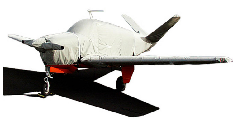
Beech Bonanza Full Cover Set

WINTER USE MATERIAL - Made with Solution-Dyed Polyester fabric, this option is intended for seasonal use to aid in deicing, rain mitigation, or for occasional travel. The material is lighter and more compact, but more susceptible to UV damage and may have a shorter useful life if used continuously outside than the all-year use material.