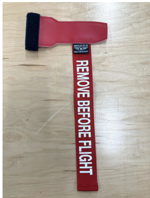
Pitot Tube Cover

Engine Inlet Plugs are custom fit for your North American T28 Trojan intakes, made with heavy-duty vinyl material, and stuffed with a single block of sculpted urethane foam. Each plug has a zipper that allows the foam to be removed and dried if necessary. Engine plugs have warning flags that are visible from the cockpit or 'remove before flight' streamers sewn onto the face of the plugs. Most plugs are imprinted with the aircraft registration number in black for an extra charge. Storage bag NOT included. Engine plugs may be inserted after flight when the engine is still warm. Engine Inlet Plugs are commonly referred to as Cowl Plugs, Intake Plugs, Cowl Blocks, Engine Blocks, and Engine Bungs.