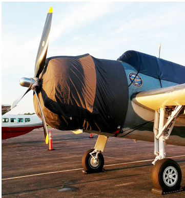
TBM Avenger Engine Cover

This cover type is made from Silver Acrylic Sunbrella canvas and is 100% lined with a soft and smooth microfiber. Bruce's Custom Covers developed this material combination especially for aircraft protection. The outer material is medium weight and treated for water resistance, UV resistance and anti-static buildup. The inner lining is a very soft and smooth microfiber to prevent scratching. The material is very reflective, and tests show that the cabin interior temperature can be reduced to near-ambient temperature on the hottest of days. It is water, ice and snow repellent, yet breathable to allow moisture to escape from between the cover and the aircraft surface.