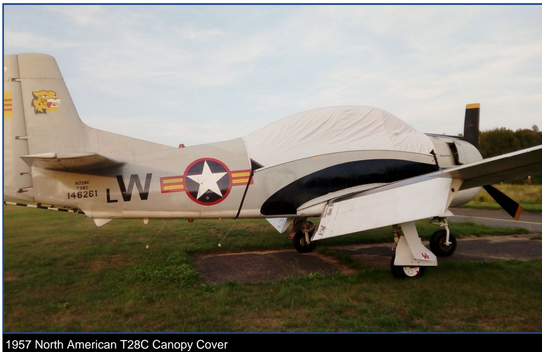
1957 North American T28C Canopy Cover