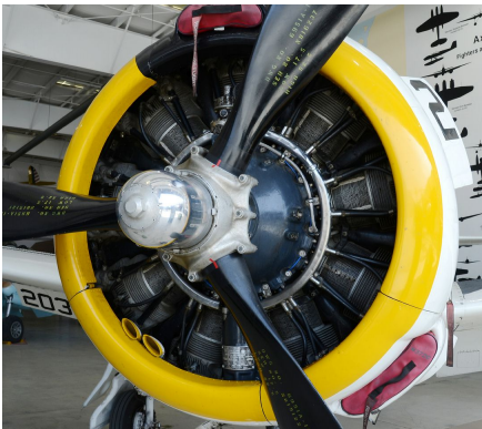
North American T28 Trojan Carb. Air Inlet Plug