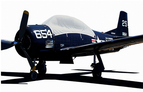
North American T28 Canopy Cover

Travel Covers are made with Silver Solution-Dyed Polyester fabric and only lined over the windshield to save weight. The material is lightweight and more compact for easy stowage in the aircraft. The polyester material is water resistant, but only intended for occasional use outside. We also have an ultra lightweight material available for fitted hangar dust covers. For daily outdoor use, the non-travel Sunbrella Cover is the best choice.