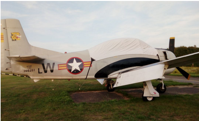
1957 North American T28C Canopy Cover

This cover type is made from Silver Acrylic Sunbrella canvas and is 100% lined with a soft and smooth microfiber. Bruce's Custom Covers developed this material combination especially for aircraft protection. The outer material is medium weight and treated for water resistance, UV resistance and anti-static buildup. The inner lining is a very soft and smooth microfiber to prevent scratching. The material is very reflective, and tests show that the cabin interior temperature can be reduced to near-ambient temperature on the hottest of days. It is water, ice and snow repellent, yet breathable to allow moisture to escape from between the cover and the aircraft surface.