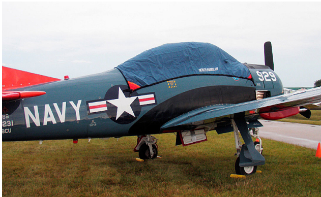
North American T28 Canopy Cover