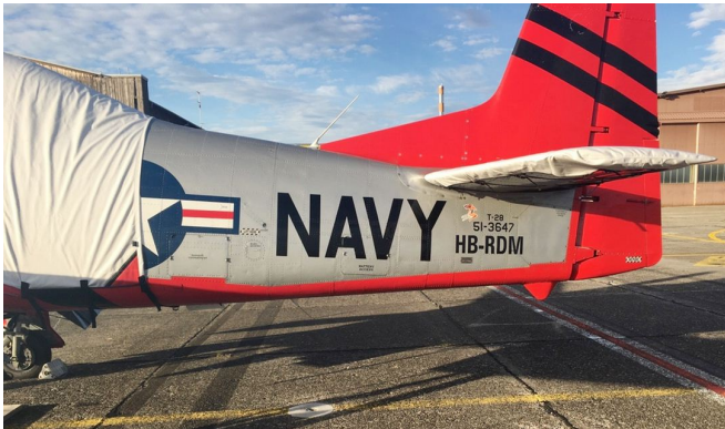
North American T28 Extended Canopy Cover