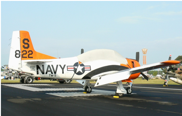
North American T-28 Canopy Cover