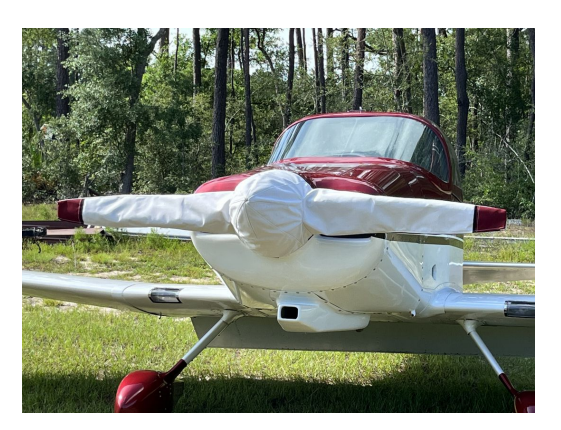
Mustang 2 Prop/Spinner Cover