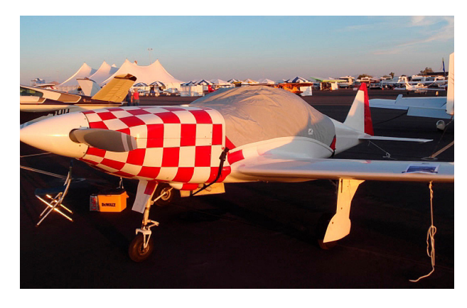
Thorp T-18 Canopy Cover