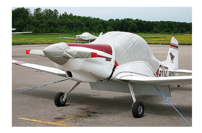
Bushby Mustang Canopy cover and Propellor/Spinner cover

This cover type is made from Silver Acrylic Sunbrella canvas and is 100% lined with a soft and smooth microfiber. Bruce's Custom Covers developed this material combination especially for aircraft protection. The outer material is medium weight and treated for water resistance, UV resistance and anti-static buildup. The inner lining is a very soft and smooth microfiber to prevent scratching. The material is very reflective, and tests show that the cabin interior temperature can be reduced to near-ambient temperature on the hottest of days. It is water, ice and snow repellent, yet breathable to allow moisture to escape from between the cover and the aircraft surface.