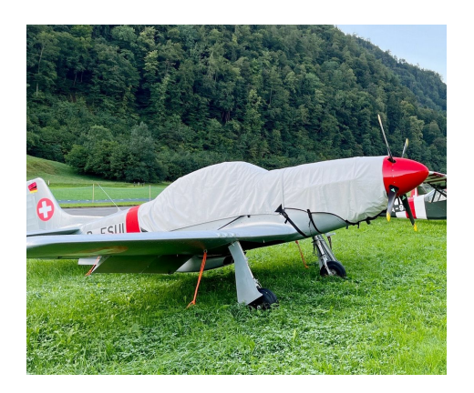
Stewart S-51 Canopy & Engine Covers

the hottest of days. It is water, ice and snow repellent, yet breathable to allow moisture to escape from between the cover and the aircraft surface.