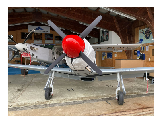
SW-51 Mustang Engine Cover