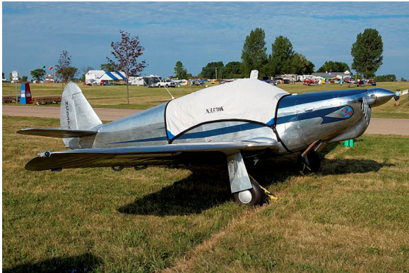
Globe Swift Canopy Cover

This cover type is made from Silver Acrylic Sunbrella canvas and is 100% lined with a soft and smooth microfiber. Bruce's Custom Covers developed this material combination especially for aircraft protection. The outer material is medium weight and treated for water resistance, UV resistance and anti-static buildup. The inner lining is a very soft and smooth microfiber to prevent scratching. The material is very reflective, and tests show that the cabin interior temperature can be reduced to near-ambient temperature on the hottest of days. It is water, ice and snow repellent, yet breathable to allow moisture to escape from between the cover and the aircraft surface.