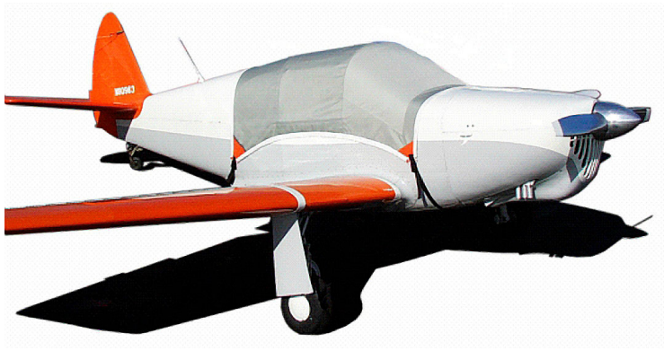
Standard Canopy Cover for Swift