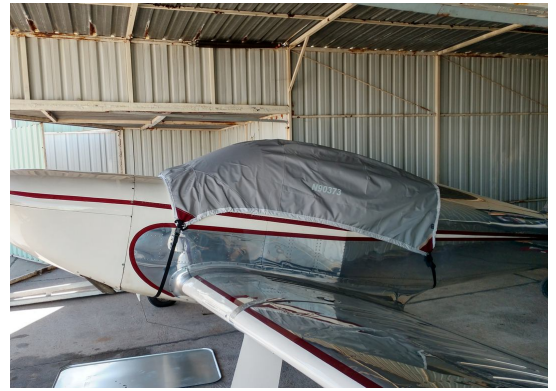
Globe GC-1B Lightweight Travel Cover