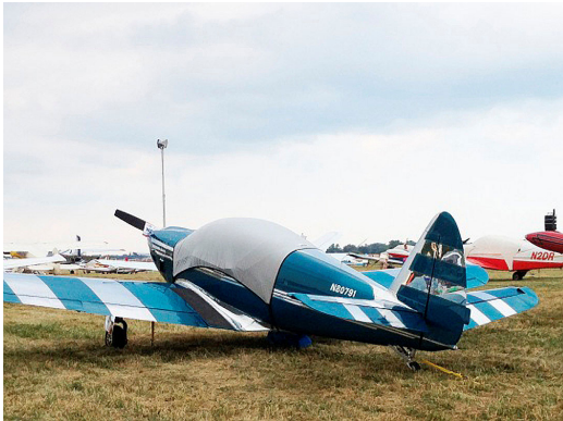
Swift Light Weight Canopy Cover