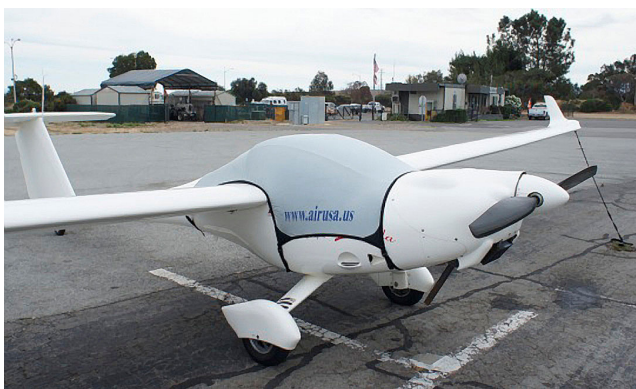
Lambada Travel Canopy Cover