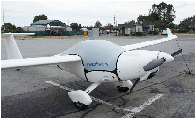
Lambada Travel Canopy Cover