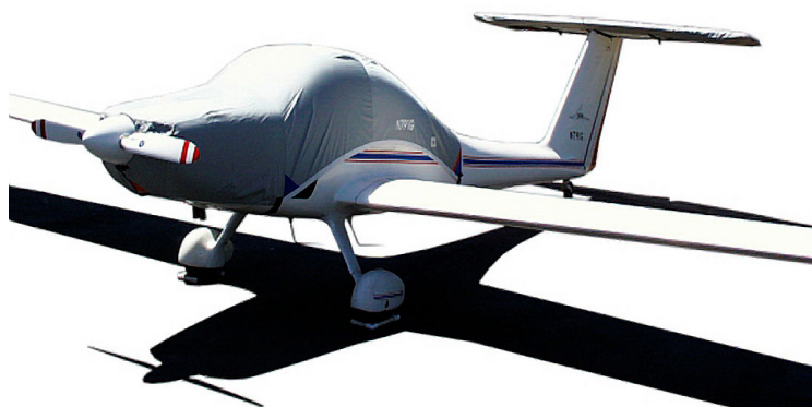
Grob 109 Canopy/Engine Cover & Horiz. Stabilizer Cover