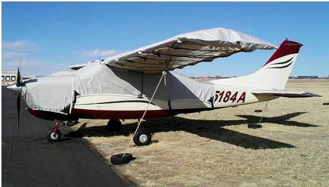
Cessna 210 Engine, Canopy Cover w/ Baggage Door ext. & Wing Covers

WINTER USE MATERIAL - Made with Solution-Dyed Polyester fabric, this option is intended for seasonal use to aid in deicing, rain mitigation, or for occasional travel. The material is lighter and more compact, but more susceptible to UV damage and may have a shorter useful life if used continuously outside than the all-year use material.