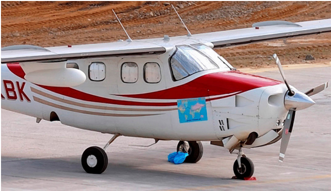
Cessna P210 HeatShield Set

Windshield Heatshields are interior sunshades for an aircraft's front windshield. The product is a unique composite of closed-cell foam with a silver mylar finish. The semi-rigid design is stiff enough to stand along the inside of the windshield using sun visors or window framing. It folds up flat and easily stores in the included storage sleeve. Some designs may require velcro and suction cups or split right and left sides. A Heatshield is an excellent short-term remedy for cockpit overheating. An external fabric cover is far more effective and practical for long-term protection.