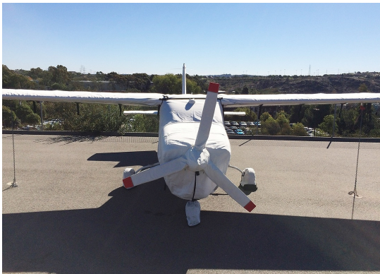
Cessna 210 Full Cover Set

This cover type is made from Silver Acrylic Sunbrella canvas and is 100% lined with a soft and smooth microfiber. Bruce's Custom Covers developed this material combination especially for aircraft protection. The outer material is medium weight and treated for water resistance, UV resistance and anti-static buildup. The inner lining is a very soft and smooth microfiber to prevent scratching. The material is very reflective, and tests show that the cabin interior temperature can be reduced to near-ambient temperature on the hottest of days. It is water, ice and snow repellent, yet breathable to allow moisture to escape from between the cover and the aircraft surface.