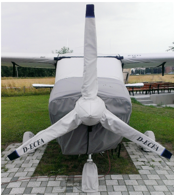
Cessna 210 Prop Cover