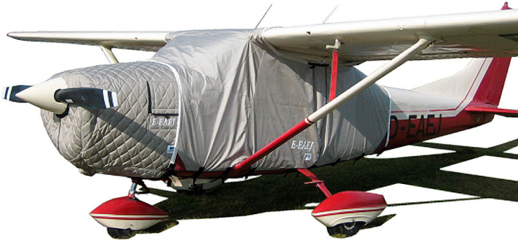
Cessna 182 Insulated Engine Cover ext. to l.e of nose gear, Extended Canopy Cover

This cover type is made from Silver Acrylic Sunbrella canvas and is 100% lined with a soft and smooth microfiber. Bruce's Custom Covers developed this material combination especially for aircraft protection. The outer material is medium weight and treated for water resistance, UV resistance and anti-static buildup. The inner lining is a very soft and smooth microfiber to prevent scratching. The material is very reflective, and tests show that the cabin interior temperature can be reduced to near-ambient temperature on the hottest of days. It is water, ice and snow repellent, yet breathable to allow moisture to escape from between the cover and the aircraft surface.