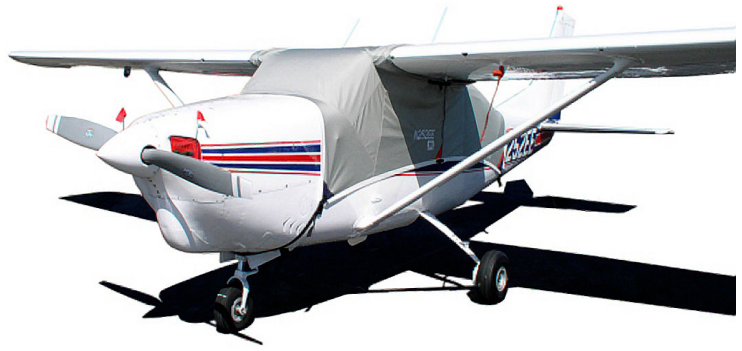
Cessna 210 Over-Top Canopy Cover