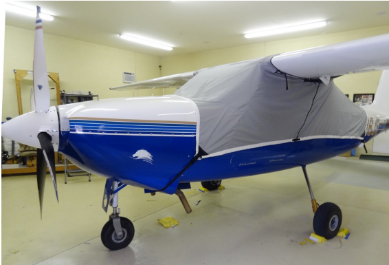
Stallion Canopy Cover, Light Weight Travel Type