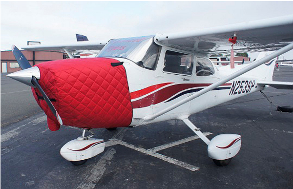
Cessna 172 Insulated Engine Cover, fully enclosed