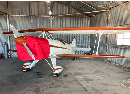
SKYBOLT, Insulated Hangar Blanket, Custom Fit Interior Use)