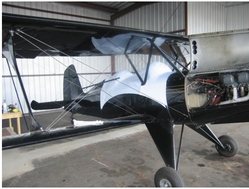
Starduster Too Canopy Cover, test fit cover