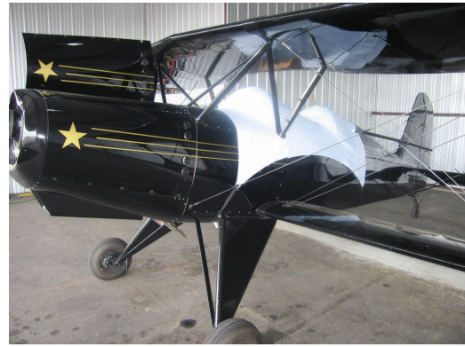
Starduster Too Canopy Cover, test fit cover