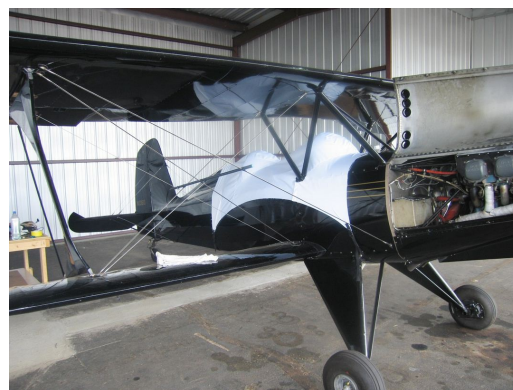
Starduster Too Canopy Cover, test fit cover