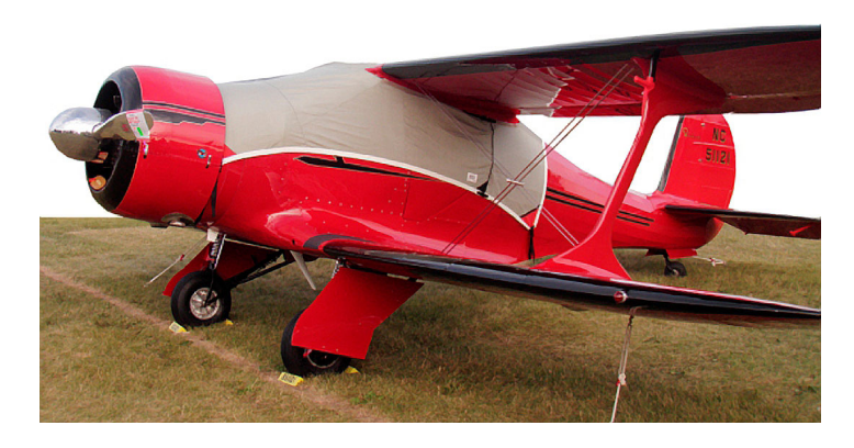
Beech Staggerwing Canopy Cover

Travel Covers are made with Silver Solution-Dyed Polyester fabric and only lined over the windshield to save weight. The material is lightweight and more compact for easy stowage in the aircraft. The polyester material is water resistant, but only intended for occasional use outside. We also have an ultra lightweight material available for fitted hangar dust covers. For daily outdoor use, the non-travel Sunbrella Cover is the best choice.