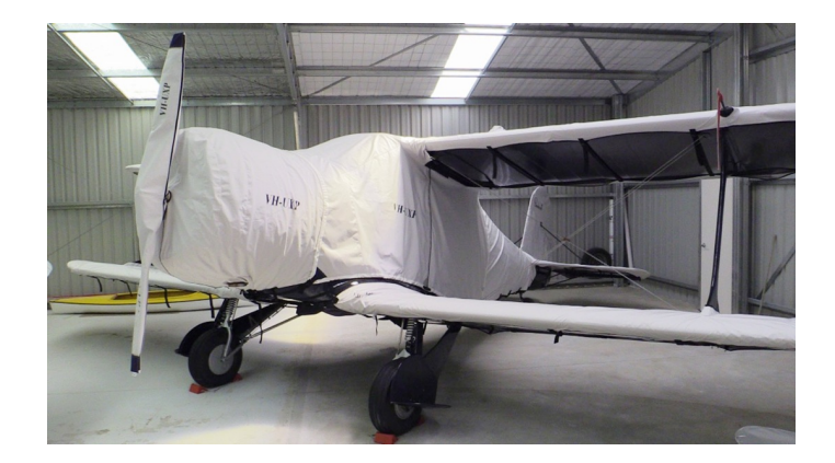
Beech Staggerwing Complete Cover Set

This cover type is made from Silver Acrylic Sunbrella canvas and is 100% lined with a soft and smooth microfiber. Bruce's Custom Covers developed this material combination especially for aircraft protection. The outer material is medium weight and treated for water resistance, UV resistance and anti-static buildup. The inner lining is a very soft and smooth microfiber to prevent scratching. The material is very reflective, and tests show that the cabin interior temperature can be reduced to near-ambient temperature on the hottest of days. It is water, ice and snow repellent, yet breathable to allow moisture to escape from between the cover and the aircraft surface.