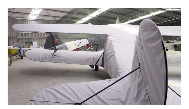
Beech Staggerwing Complete Cover Set

WINTER USE MATERIAL - Made with Solution-Dyed Polyester fabric, this option is intended for seasonal use to aid in deicing, rain mitigation, or for occasional travel. The material is lighter and more compact, but more susceptible to UV damage and may have a shorter useful life if used continuously outside than the all-year use material.