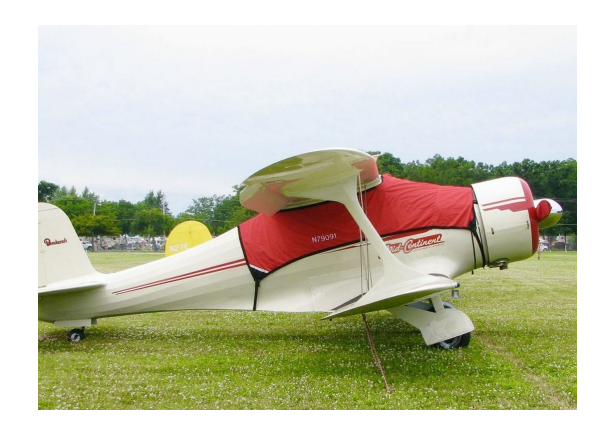
Beech Staggerwing Canopy Cover