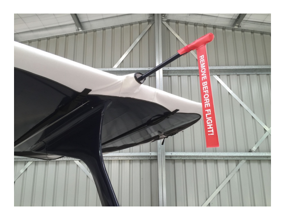
Beech Staggerwing Complete Cover Set, Upper Wing Detail