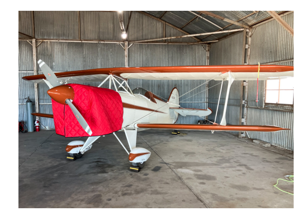
SKYBOLT, Insulated Hangar Blanket, Custom Fit Interior Use)