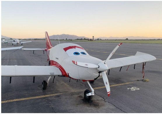
SportCruiser Canopy/Engine & Wing Covers