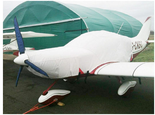
PiperSport Canopy/Engine Cover, Wing Locker Covers