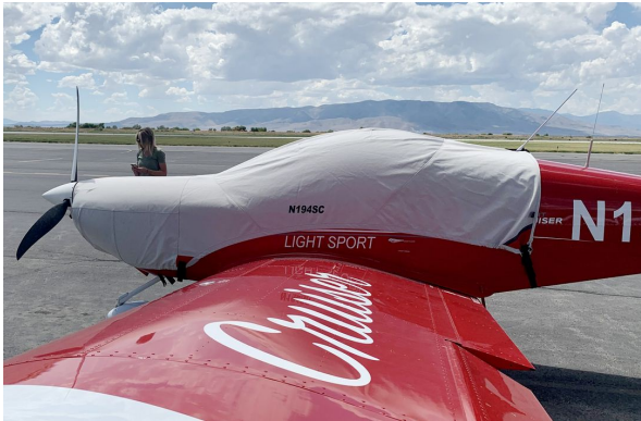
Sportcruiser Extended Canopy/Engine Cover