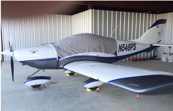
PiperSport Light Weight Travel Cover

This cover type is made from Silver Acrylic Sunbrella canvas and is 100% lined with a soft and smooth microfiber. Bruce's Custom Covers developed this material combination especially for aircraft protection. The outer material is medium weight and treated for water resistance, UV resistance and anti-static buildup. The inner lining is a very soft and smooth microfiber to prevent scratching. The material is very reflective, and tests show that the cabin interior temperature can be reduced to near-ambient temperature on the hottest of days. It is water, ice and snow repellent, yet breathable to allow moisture to escape from between the cover and the aircraft surface.