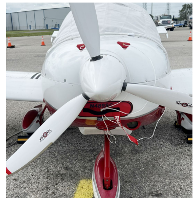
SportCruiser Engine Inlet Plugs