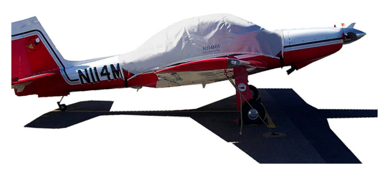
Micco SP20 Canopy Cover & Engine Inlet Plugs