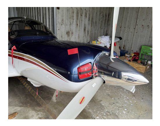
Micco SP-20 Engine Plugs

Engine Inlet Plugs are custom fit for your Micco SP20 intakes, made with heavy-duty vinyl material, and stuffed with a single block of sculpted urethane foam. Each plug has a zipper that allows the foam to be removed and dried if necessary. Engine plugs have warning flags that are visible from the cockpit or 'remove before flight' streamers sewn onto the face of the plugs. Most plugs are imprinted with the aircraft registration number in black for an extra charge. Storage bag NOT included. Engine plugs may be inserted after flight when the engine is still warm. Engine Inlet Plugs are commonly referred to as Cowl Plugs, Intake Plugs, Cowl Blocks, Engine Blocks, and Engine Bungs.