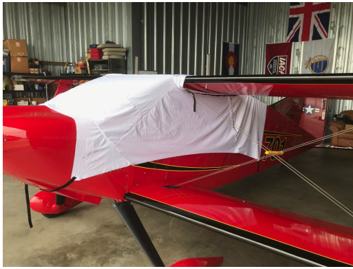
Sorrell Hiperbipe Canopy Cover (test fit cover)