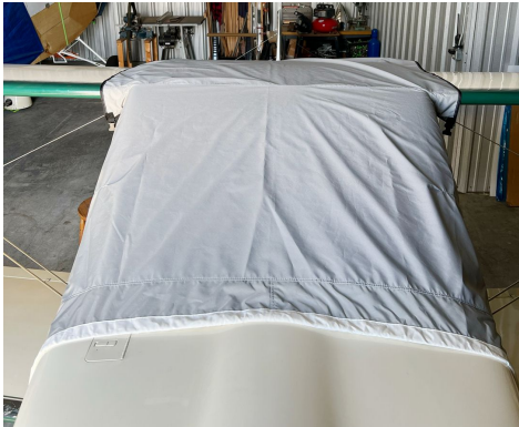
Sorrell SNS-7 Hiperbipe Over The Top Travel Canopy Cover