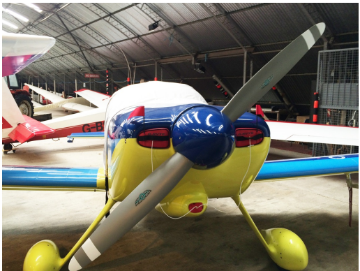
Van's RV-6 Engine Inlet Plugs