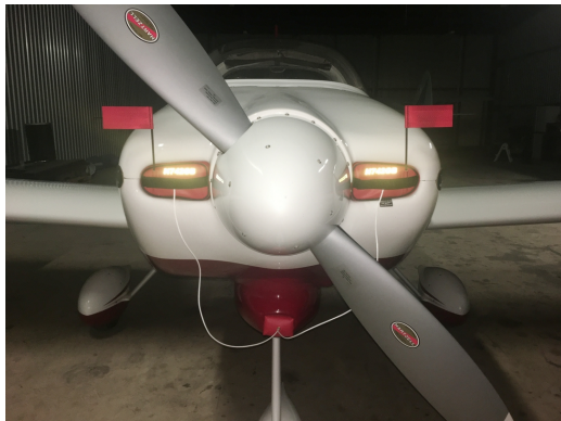
Van's Aircraft RV-7A Engine Inlet Plugs

Engine Inlet Plugs are custom fit for your Sorrell Hiperbipe SNS-7 intakes, made with heavy-duty vinyl material, and stuffed with a single block of sculpted urethane foam. Each plug has a zipper that allows the foam to be removed and dried if necessary. Engine plugs have warning flags that are visible from the cockpit or 'remove before flight' streamers sewn onto the face of the plugs. Most plugs are imprinted with the aircraft registration number in black for an extra charge. Storage bag NOT included. Engine plugs may be inserted after flight when the engine is still warm. Engine Inlet Plugs are commonly referred to as Cowl Plugs, Intake Plugs, Cowl Blocks, Engine Blocks, and Engine Bungs.