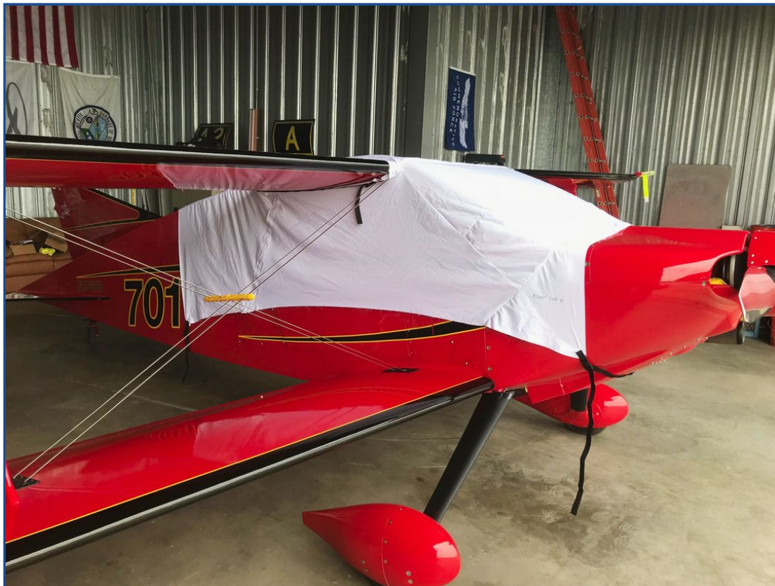
Sorrell Hiperbiplane Canopy Cover (test fit cover)