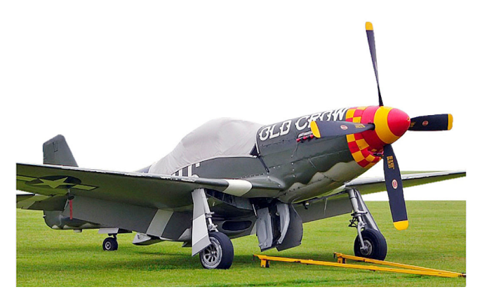
Canopy Cover, Chin Scoop & Exhaust Plugs